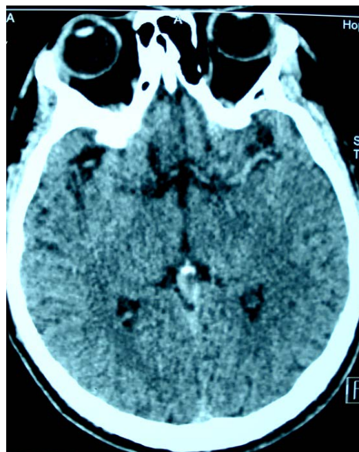
Figure 3 - Computed tomography (CT) of brain after one week, revealing a complete resolution of the abscess