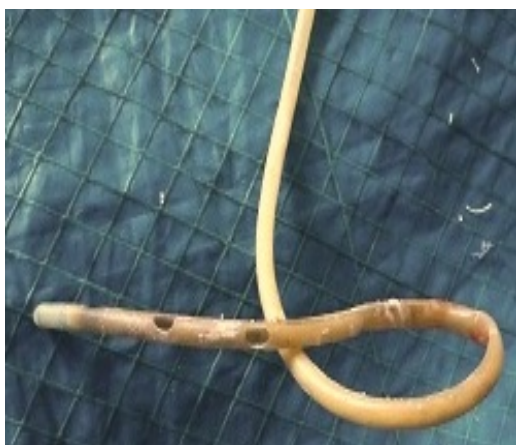
Figure 3 - Retrieved tube