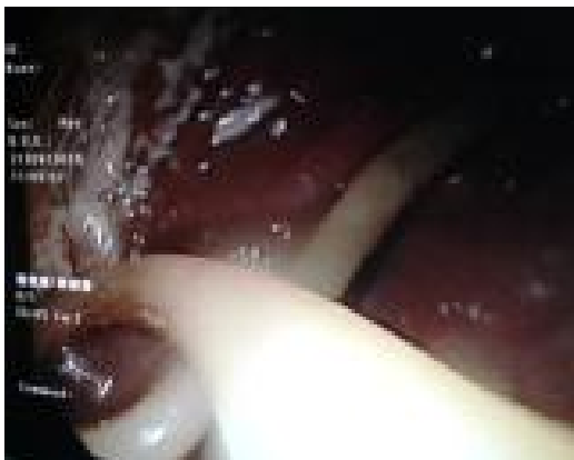
Figure 2 - Kinked and adhered nasogastric tube