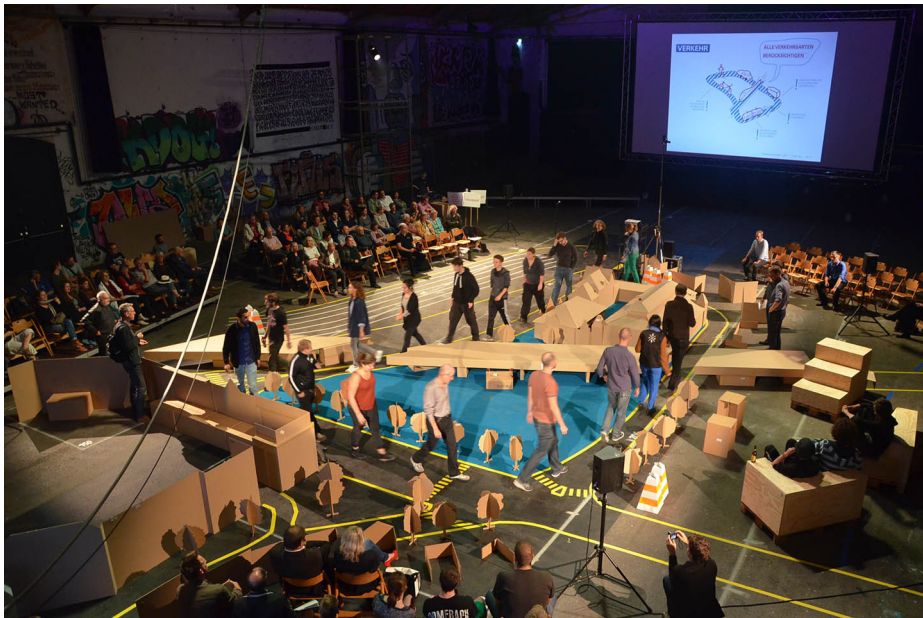
Figure 6. Co-creation Tool: Oversize Model 1-4. Credits by Urban Catalyst

In some cities and universities, the co-creative approach has already been tested and developed as a reaction to people's increased interest in actively changing their living environment. This runs from city walking tours during which people tell planners about local places to dialogue-oriented planning instruments. The latter encompass walk-in urban development models at scale 1:50 to provide a better understanding of planned construction interventions, or 1:1 prototypes in the urban space that enable the direct on-site exchange of information and ideas, as well as digital tools that give a simulated look into the future and provide access to spatial dimensions in urban development for "non-planners".