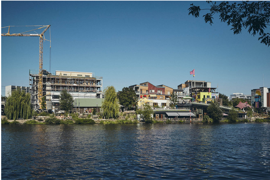
Figure 1. Holzmarkt Berlin.

Due to rising property prices (which had initially stagnated after the fall of the Berlin Wall), the plot of land occupied by “Bar 25” was put up for sale to the highest bidder in 2011. This prompted a largely informal group of users to assume a formal role, becoming an organization with legal capacity (Holzmarkt plus eG 2013). When the land was successfully purchased by a swiss foundation for the Holzmarkt plus eG, the management and planning skills of the team also had to be expanded. The basic qualifications of the users, representing an assorted group of professions (e.g. chefs, joiners, educators and photographers), were no longer adequate from this point on to cope with the financial and planning-related demands of the project. In fact, a recurring characteristic of co-production is the acquisition and expansion of skills by the core team in order to realize an alternative form of property development.