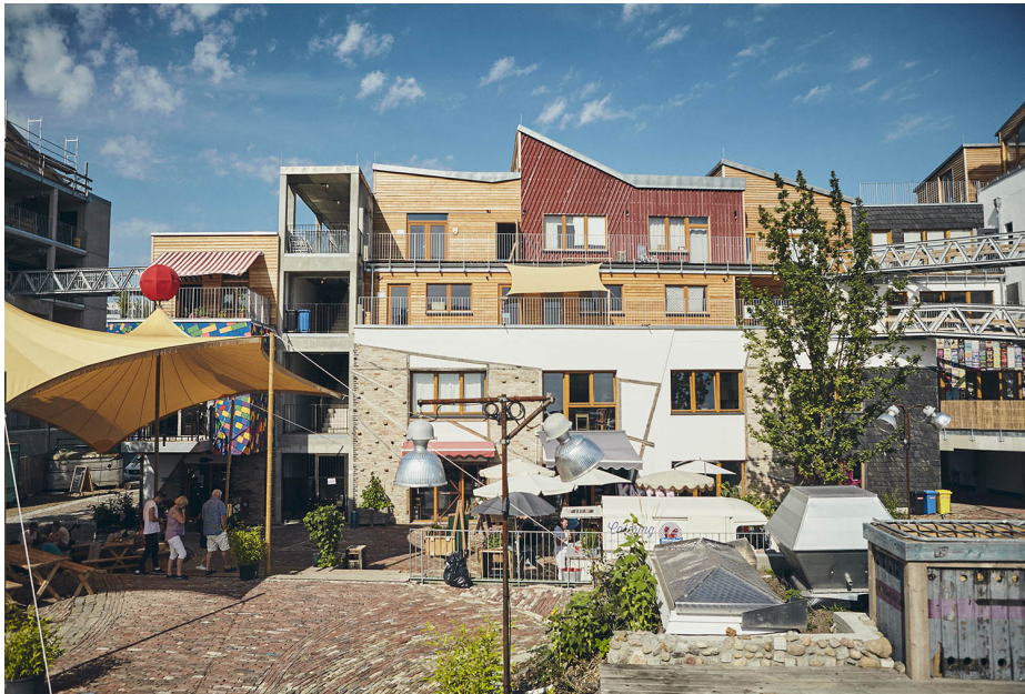
Figure 4. Holzmarkt facades.

Two important questions have to be answered in this process: How do the bottom-up strategies from the initial conversion phase relate to the construction of new buildings, landscaped open spaces or new access roads? And who is responsible for the maintenance, security and upkeep of the surface areas? While the state of “incompleteness” is both a prerequisite for and the special quality of user-based developments, this runs against the determinism of planning. In the tug-of-war between determination and openness, those approaches survive that define small-scale zones within an overall concept, for which rules of play can be agreed upon between those involved and external experts, and then set down in planning law (Schmidt-Eichstaedt 2010).