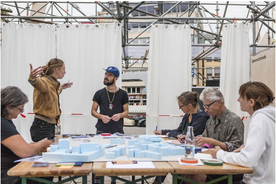
Figure 2. On Site Participation Steintorplatz, Hannover.

The requisite professional know-how is gained in the course of the project autodidactically and with the help of consultants. Development and financing strategies are aimed at acquiring land, ensuring stable rent and lease agreements, and establishing cooperative or hereditary leasehold models. As the project proceeds, their status changes from users to owners, administrators and operators. In the process, they bring life to, use and combine dormant resources. This ranges from the recycling, upgrading or indeed upcycling of existing physical stock as well as non-material resources such as personal commitments of work and time. Thus another resource of user-based urbanism can be described as the social capital invested by the actors involved.