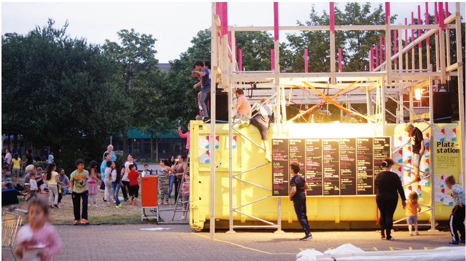
Figure 7. Cocreation: On-site Participation “Platzstation” in Cologne Chorweiler.

Co-production often develops due to pressures from civil society, in particular activists, and is certainly also a process that has the potential for conflict. Consequently, the negotiation and planning processes are not always harmonious (Watson 2014).