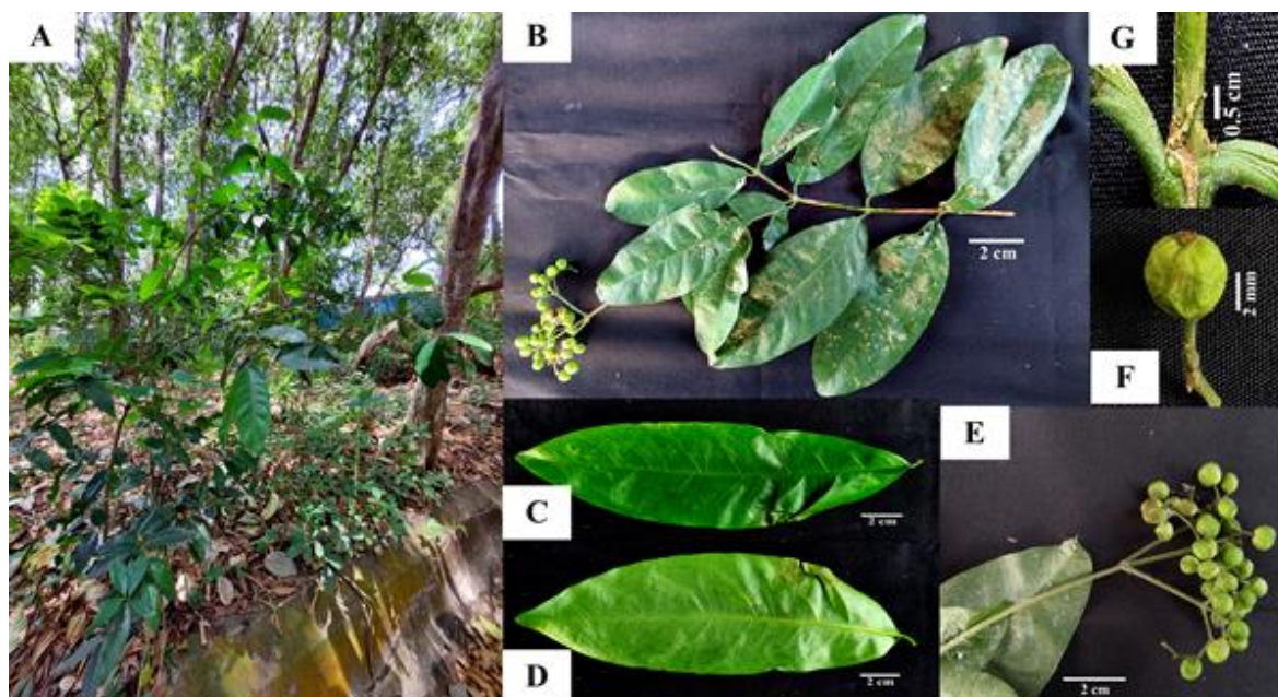
Figure 1. Tarennia costata (Miq.) Merr. A. Stature; B. Complete branch; C. Adaxial surface of the leaf; D. The abaxial surface of the leaf; E. Fruiting; F. Fruit; G. Stipula.

Leaves coriaceous, obovate, 2-30 by 0.7-14.5 cm, base cuneate to attenuate, apex obtuse to acute and cuspidate, upper surface sparsely to densely pubescent, smooth to the touch, primary vein pubescent, secondary veins 6-14 pairs, flat, tertiary veins obscure; lower surface pubescent, primary vein densely pubescent, secondary veins prominent, tertiary veins slightly visible to distinct, secondary and tertiary veins as ladder like connections; petioles pubescent, 1-2 cm; stipules persistent, lobes triangular with mucronate apex, 3-6 mm long, lower surface pubescent, costa subprominent. Inflorescence terminalis, corymbose, peduncle 1.5-4 cm longer than petiole, rachis 0.7-2 cm long, peduncles and rachis pubescent; bract linear, apex acuminate, 0.2-0.7 by 0.05 cm, with velutinous indumentum.