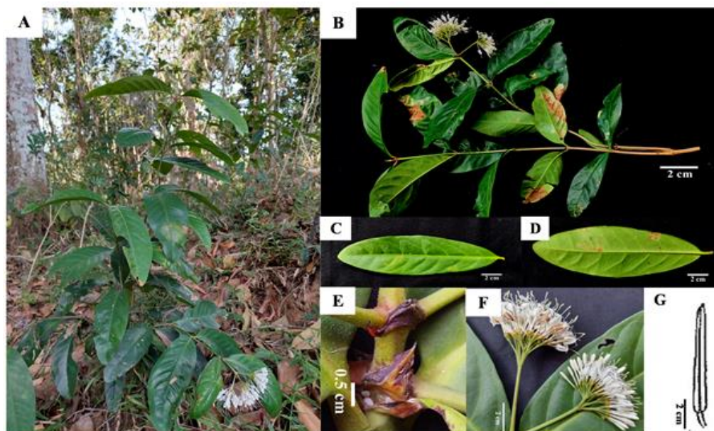
Figure 2 Tarenna fragrans (Blume) Coord. & Valetton. A. Stature; B. Complete branch; C. Adaxial surface of the leaf; D. The abaxial surface of the leaf; E. Stipules; F. Umbrella inflorescences; G. Bracts in flowers. Photo documentation by Ashari Bagus Setiawan (A-F) and sketch drawing by Novita Kartika Indah (G).

Treelet to tree , up to 10 m tall. Bark smooth, greyish brown. Inner bark brown. Twig quadrangular, brown, pubescent to glabrescent. Leaves chartaceous to thinly coriaceous, elliptical to obovate, 5-18.5 by 1.2-7.8 cm, base attenuate, apex acuminate, upper surface glabrescent to glabrous, primary vein glabrescent to glabrous, secondary veins 6-13 pairs, flat, tertiary veins obscure; lower surface glabrescent, primary vein glabrescent, secondary veins visible, tertiary veins obscure; petioles pubescent to glabrescent, 0.5-1.5 cm; stipules persistent, lobes triangular with cuspidate apex 5-6 mm long, lower surface pubescent, costa prominent. Inflorescence terminal, thyrse, peduncle 1.5-3.5 cm longer than petiole, rachis 0.5-1.5 cm long, peduncles and rachis pubescent; bract lanceolate become foliar, apex acute, 0.4-0.6 by 0.05-0.1 cm, with pubescent indumentum.