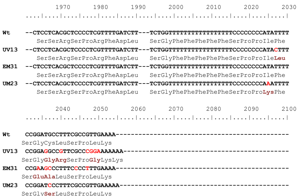
Figure 1. Sequence alignment of the reference strain, mutants, and wild-type of Penicillium sp. ID10-T065