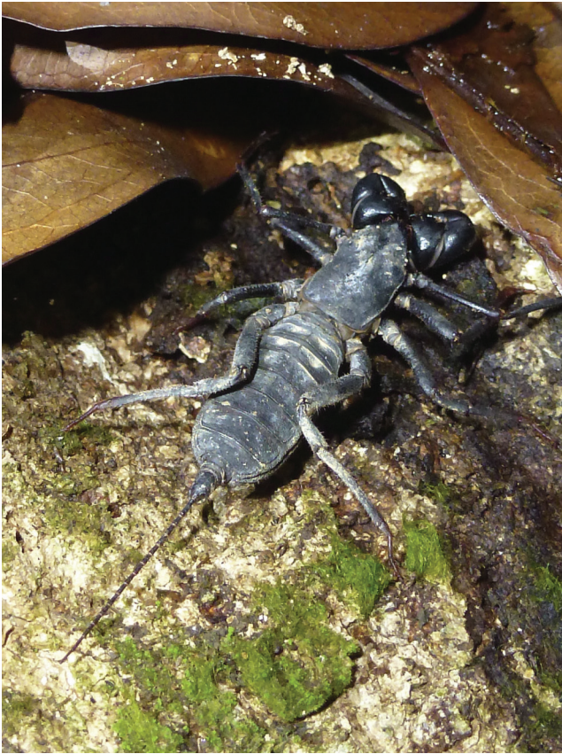
Fig. 1 - Recent thelyphonid, Thelyphonus doriae Thorell, 1888, Bukit Panjang, Singapore (1°21'23.38"N 103°48'46.48"E)