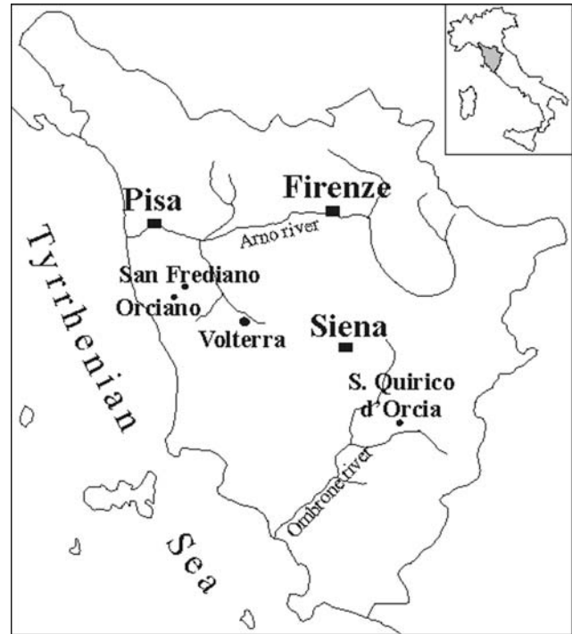
Fig. 1 - Sketch map of Tuscany.

monographs on the Pliocene shark communities (Lawley 1875, 1876, 1877, 1878, 1879, 1881), and at present, his collection represents one of the most famous and important historical Neogene shark teeth collection in Italy.