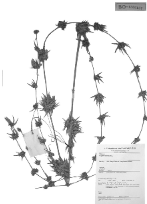
Fig. 7. Inflorescence of Gigantochloa aya Widjaja & Astuti. Picture from EAW 7499

Pseudospikelet 16 – 18 mm, young branch of pseudospikelet hairy, short hair; fertile floret 4, glumme 3, 5 – 10 mm, ovate, acute apex, light brown cilia on the margin, lemma 12 – 15 mm, in a roll with light brown cilia, apex acute; palea 11 – 14 mm, acute apex, keels with brown to light