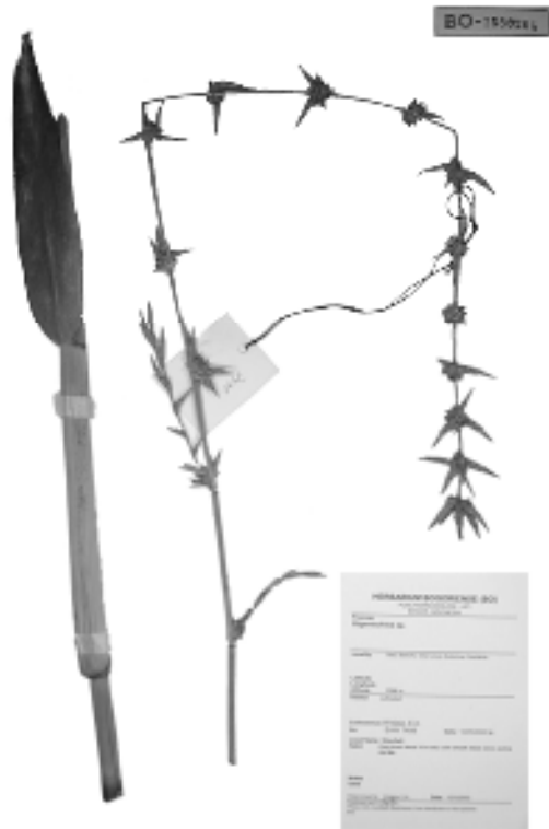
Fig. 8. Gigantochloa baliana Widjaja & Astuti. Picture from EAW 7498.

brown cilia, anthers maroon to dark magenta, up to 6 mm long with apiculate tip, ovary oblong, hairy on the apex, young fruit oblong, c. 14 mm long.