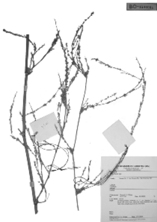
Fig. 4. Inflorescence of Dinochloa sepang Widjaja & Astuti. Picture from EAW 7561 .

Culms climbing, internodes 15.3 – 23 cm long, 0.6 – 3 cm diam., thick wall, above the node pubescent, gradually less so toward the apex, hairs white to light brown, with up to 11 lateral branches.