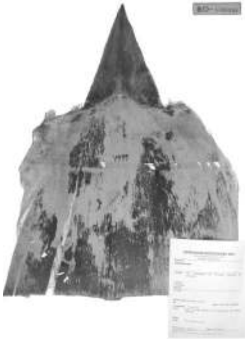
Fig. 1. Culm sheath of Bambusa ooh Widjaja & Astuti. Picture from Arinasa 4499 .

Culm erect, green, internode 25 – 75 cm, diameter 10 cm at breast height.