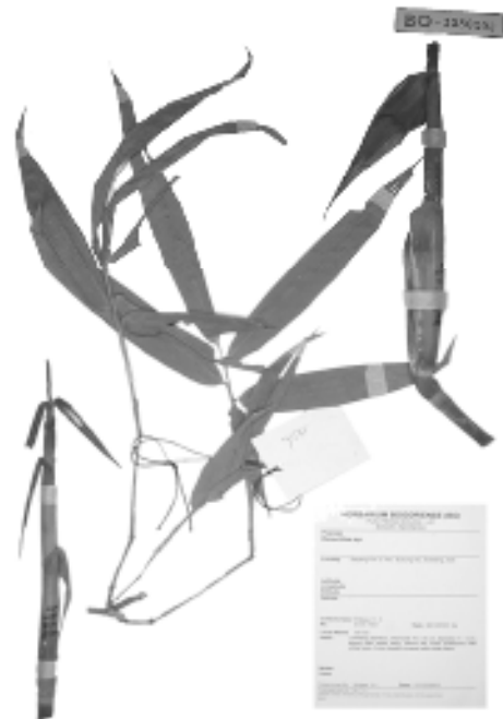
Fig. 3. Dinochloa sepang Widjaja & Astuti. Picture from EAW 7561 .

Dinochloa matmat et D. scandenti similis, culmi foliola basi pubescentia auriculae desunt, ligula setis irregularibus tenuibus, foliolium deflexum. Pseudospiculae ad 4 mm longae uniflorae, glumae lemmae apice breviter mucronato, antherae 6 magentae, fructus obovoideus. — Type: Bali, Buleleng, Sepang, EAW 7561 (BO – holotype, K, L – Isotype).