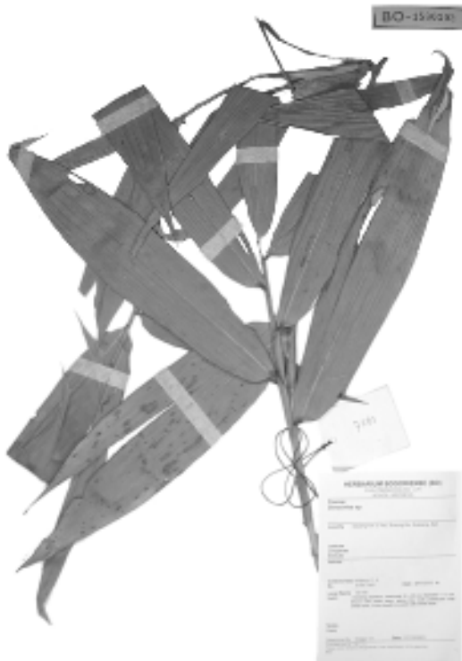
Fig. 2. Bambusa ooh Widjaja & Astuti. Picture from Arinasa 4499 .

Culm sheath tardily caducous, covered by brown hairs, auricle rounded up to 8 mm tall, with 2.5 – 3.7 cm wide with c. 2 cm long bristles,