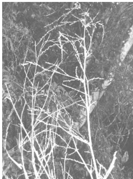
Fig. 5. Inflorescence of Dinochloa sepang Widjaja & Astuti. Picture in the type locality.

NOTES. This species is very similar to D. matmat and D. scandens , but differs by its pubescent culm sheath.