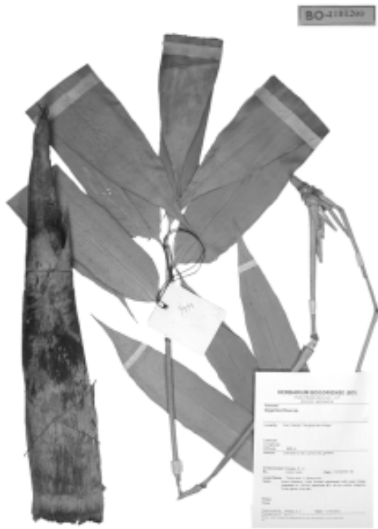
Fig. 6. Gigantochloa aya Widjaja & Astuti. Picture from EAW 7499.

Leaf blades 21 – 35 x 3.2 – 6 cm, below with scattered white hairs, above glabrous; auricle rounded, 3 mm high by 2 mm width, glabrous, ligule up to 4 mm high, irregular almost entire with fine bristle.