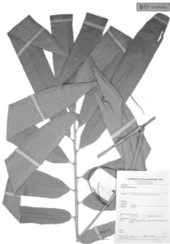
Fig. 9. Leaves of Gigantochloa baliana Widjaja & Astuti. Picture from EAW 7498.