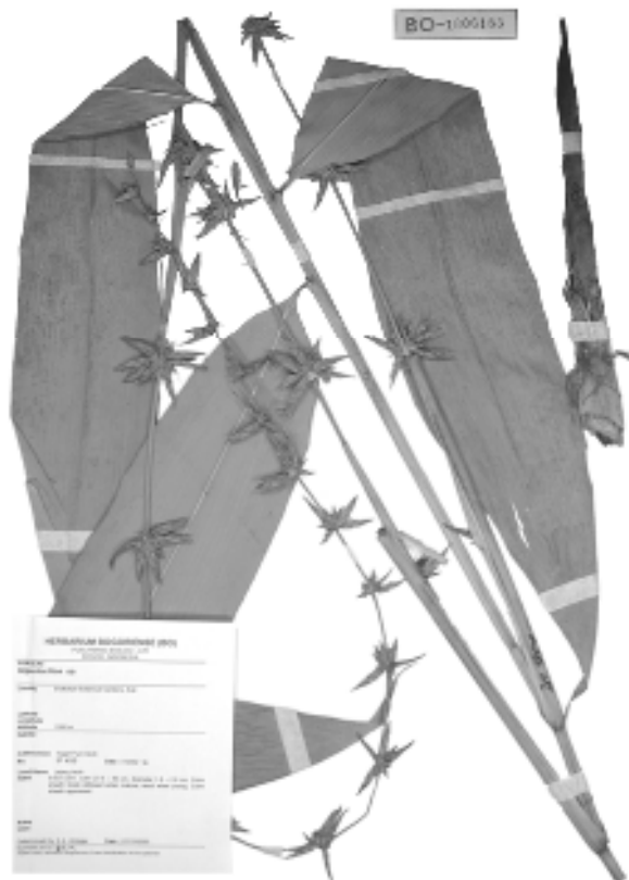
Fig.10. Gigantochloa taluh Widjaja & Astuti. Picture from IP 456.

Gigantochloa balianae similis, sed culmis glabris, foliolis deflexeis mox caducis, auriculis oriformibus ad rotundatis, ligula integra pilis tenuibus differt. Pseudospiculae ad 2 cm longae, floribus fertilibus 4. — Type: Bali, Ekakarya Botanical Garden, IP 456.