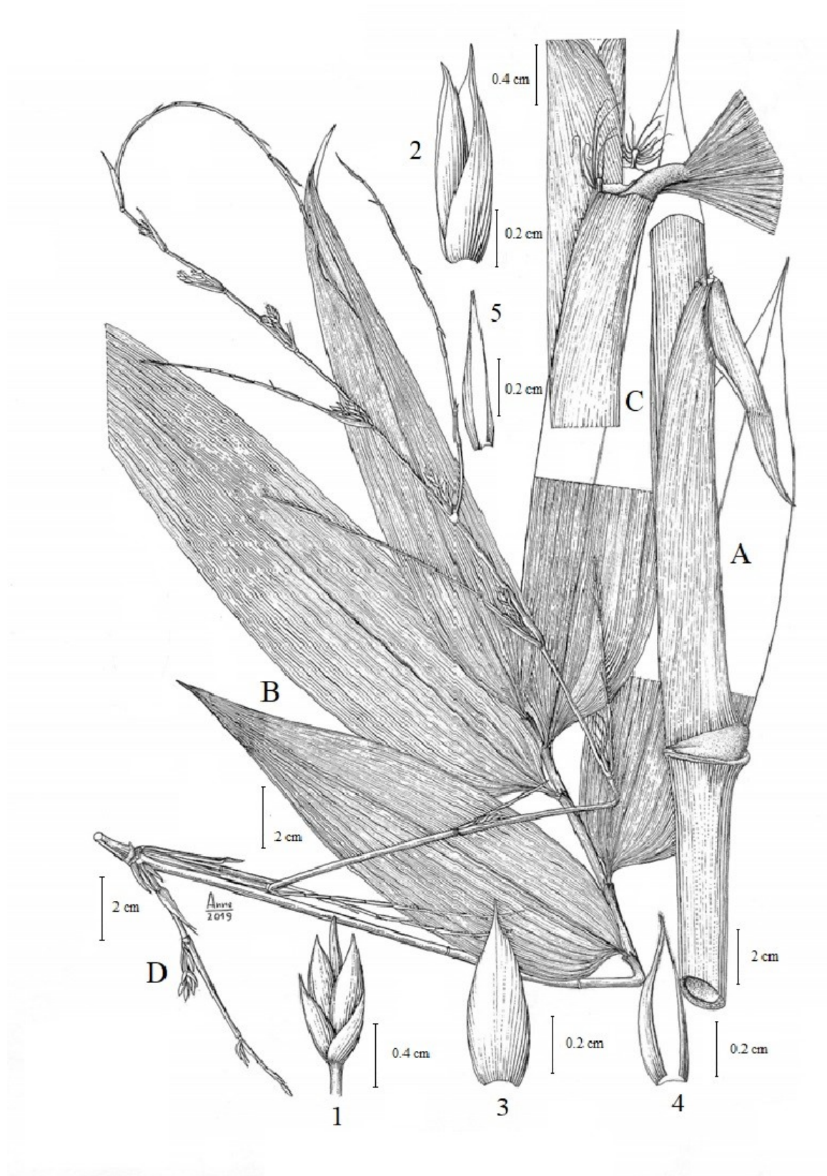
Fig. 1. Fimbribambusa rifaiana Widjaja, spec. nov. A. Culm sheath of young shoot, B. Leafy branch. C. Leaf sheath apex, D. Inflorescence (1. Pseudospikelet, 2. Floret, 3. Glume, dorsal view, 4. Lemma, ventral view, 5. Palea, ventral view). From Widjaja 7583 (BO), drawing by Anne Kusumawaty.