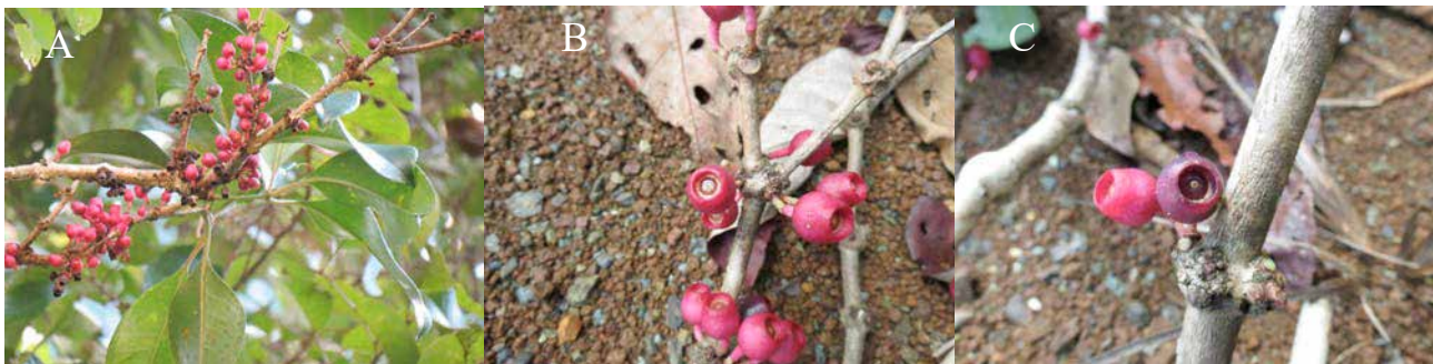
Fig. 4. Medinilla uninervis Veldk. A. Habit. Note 1-nerved leaves; B. Infructescences; C. Immature and mature fruits. (Mahroji, Fabanyo & Soleman 69, http://www.tropicos.org/ImageSearch.aspx )

Branchlets cinereous, with verrucose lenticels. Leaves equal. Leaf axils glabrous. Petioles flattened and broadened at base, 5 – 6 mm wide, glabrous. Leaf blades ca. 2.75 times as long as wide, 3.7 – 4.25 times as long as the petiole, base cuneate, margin entire, glabrous, apex acuminate, underneath glabrous, submarginal veins inconspicuous; secondary nerves inconspicuous, oblique; tertiary nerves absent. Inflorescences fascicled, simple cymes. Bracts absent. Bracteoles present. Pedicels glabrous. Hypanthium at anthesis short cylindrical, 6 – 9 by 4.5 – 5 mm, glabrous. Extra-ovarian chambers reaching to ca. half the length of the hypanthium. Epipetalous anthers fertile, shrimp-shaped, 4 – 5 mm long, ventrally bullate, superior in flower at anthesis; alternipetalous anthers staminodial, strap-shaped, 7 – 10 mm long, inferior at anthesis. Dorsal spur lanceolate, 0.6 – 1 mm long; lateral appendages connate into a Y-shaped body, not recurved, 1 – 1.2 mm long. Style glabrous. Fruits not seen.