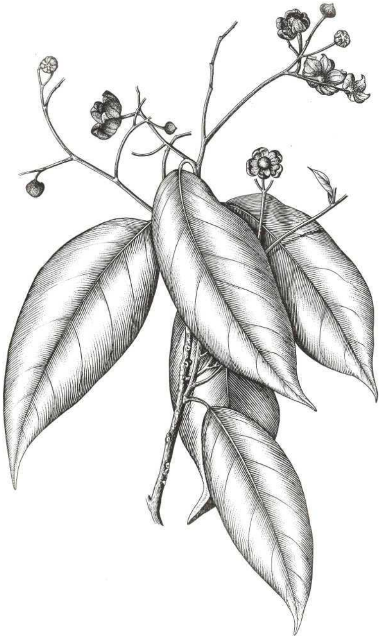
FIG. 1. Vatica affinis Thw.