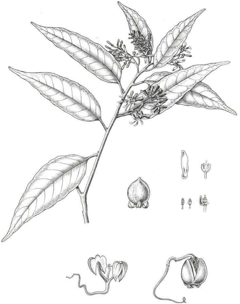
FIG. 3. Vatica obscura Trimen