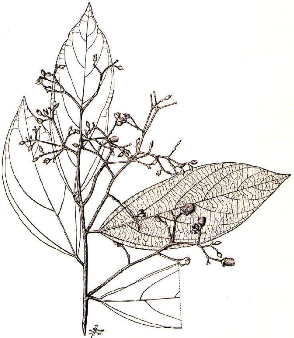
Fig. 1. — Diplodiscus paniculatus Turcz.; after Sulit 22897 (BO).

Diplodiscus paniculatus Turczaninow in Bull. Soc. impér. Natural. Moscou 31 (1) : 235. 1858; Walpers Ann. 7: 742. 1868; Villars, Nov. App. 29. 1880; Vidal, Sinops., Atlas 17, t. 20, f. D. 1883; Phaner. Cuming. Philip. 98. 1885; Revista PL vascul. Philip. 69. 1886; Merrill in Philip. Bur. Forestry Bull. 1: 36. 1903; Enum. Philip, fl. Pl. 3: 22. 1921; Perkins, Fragm. Fl. Philip. 102. 1904; C. B. Robinson in Philip. J. Sci. Bot. 3: 202. 1908; Wester, Food Pl. Philip, ed. 3: 40. 1924; Burret in Notizbl.