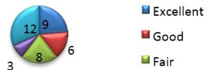
Figure 3.1 Frequency of the Students' Understanding on Metaphor

From the diagram 1 above, it showed that 9 students were categorized into excellent. There were 6 students were categorized into good. 8 students were categorized into fair. 3 students were categorized into poor. 12 students were in failed category. By considering the students' average or mean score, the students' understand on selected metaphor in English context among sixth semester students of English Education Department in Universitas Lancang Kuning was in fair category.