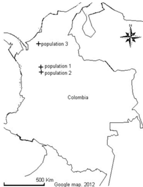
Figure 1. Location of three populations of red pitahaya ( Hylocereus spp.) collected in different regions of Colombia.

third population is located in the municipality of Monteria (Córdoba Department) (08°72'08,1"N 75°59'55,98"W), whose average temperature is 27.9 °C and annual average rainfall is 1,285 mm (The National Weather Service, 2012). All locations correspond to a tropical dry forest zone (Figure 1).