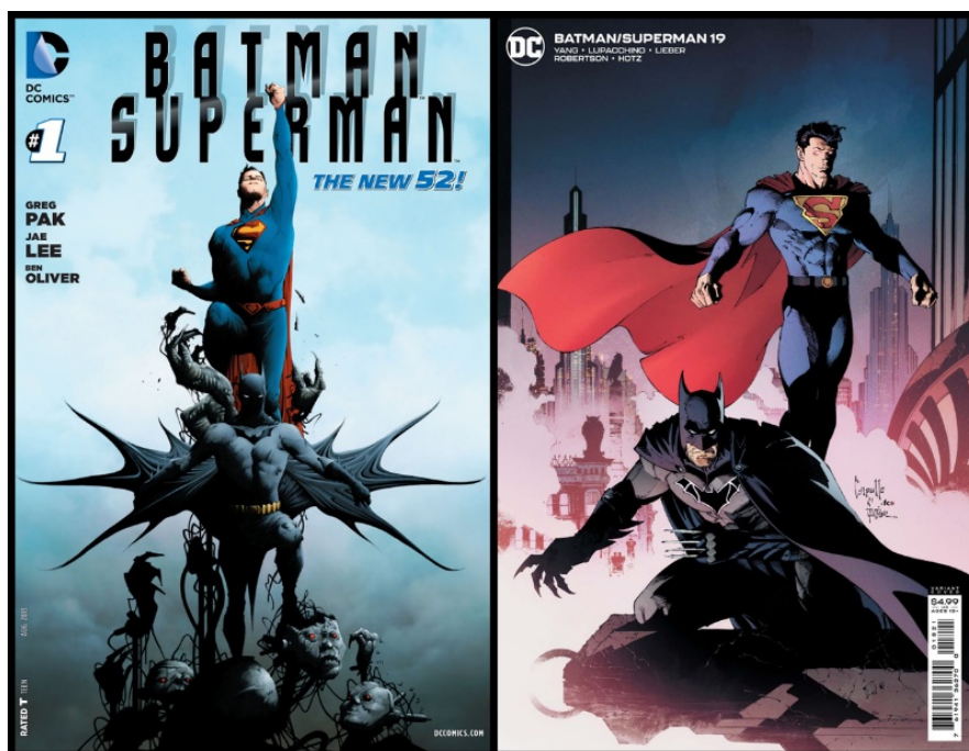
Figure 3 Batman and Superman depicted together on the covers of Batman/Superman #1 and #19.

First, Batman’s visual appearance is more Gothic than Superman’s (see fig. 3). Batman’s look was based on a staple character of Gothic narratives, the vampire (Andrae “The Darkest Knight” 23-24). Batman’s costume was specifically designed to “strike terror into their [criminals’] hearts” (Finger and Kane). Terror is a basic element of Gothic narratives (Skott 387). This element of terror combined with the similarities to vampires gives Batman’s costume “an inherent Gothic sensibility to it” (Fitch 208). On the other hand, Superman’s brightly colored costume was inspired by classical heroes and performing strongmen (Andrae “Of Supermen” 14), with the “S” insignia variously standing for “Superman” (Andrae “Of Supermen” 14), “Hope” (Waid), and “Stronger Together” (“Stronger Together”).