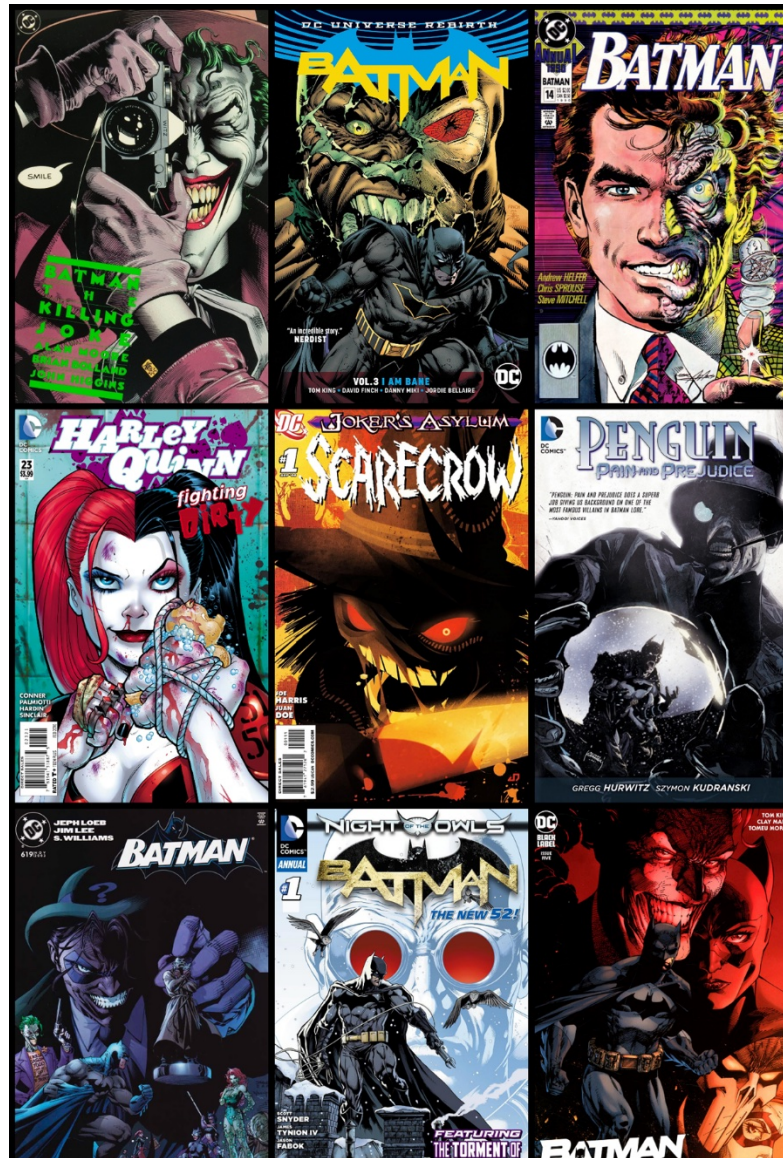
Figure 2 Some examples of how CUE-A can be implemented, including:

Further examples of the use of CUE-A can be readily found in Batman’s rogues’ gallery (see fig. 2). These examples highlight the great variety of ways that CUE-A can be implemented, including by use of objects, facial disfigurement, hair and make-up, lighting, and character collage.