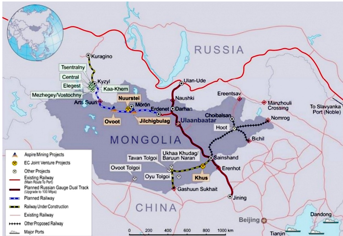
Figure 3. The China-Mongolia-Russia Economic Corridor