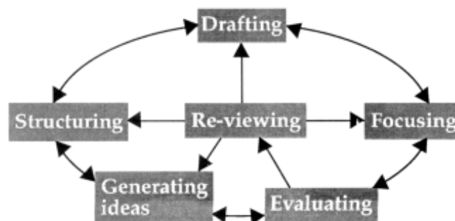
Diagram 1. A model of writing (White and Arndt, 1991, p.11).

Precisely this research was based on this approach, the process-oriented one. White and Arndt (1991) propose this framework in which there is a brief explanation about each stage.