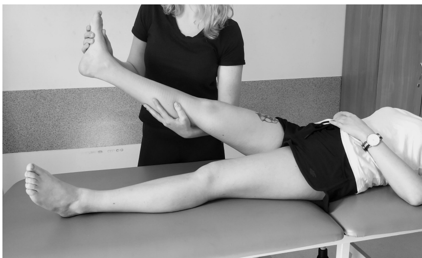
Dwg. 2. The TNT test.

The TNT test ( tibial neurodynamic test ) is a classical variation of the SLR test, where diagnostics is aimed at the tibial nerve. Additional dorsal flexure and bending of a feet are the main difference, this movement is performed as a first one during the test. This manoeuvre cause the direct tension of the nerve. This test is advisable in case of pain ailments of calf, heel or plantar foot area (5).