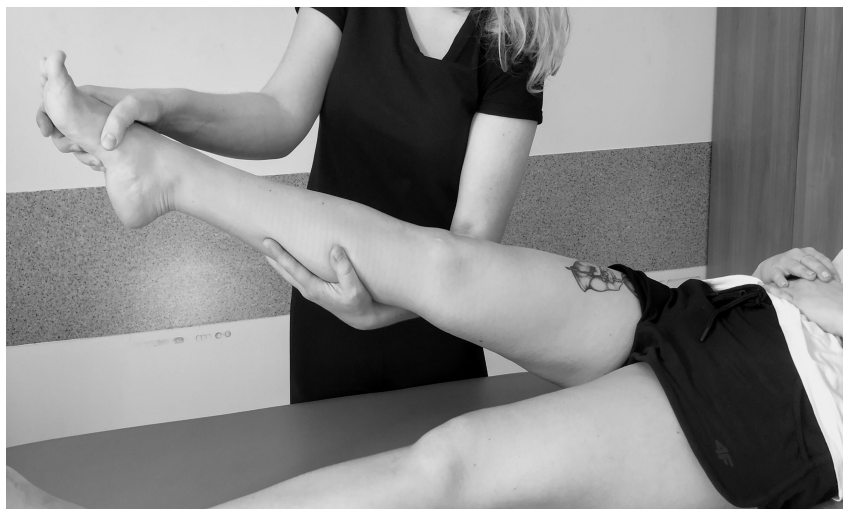
Dwg. 3. The PNT test.