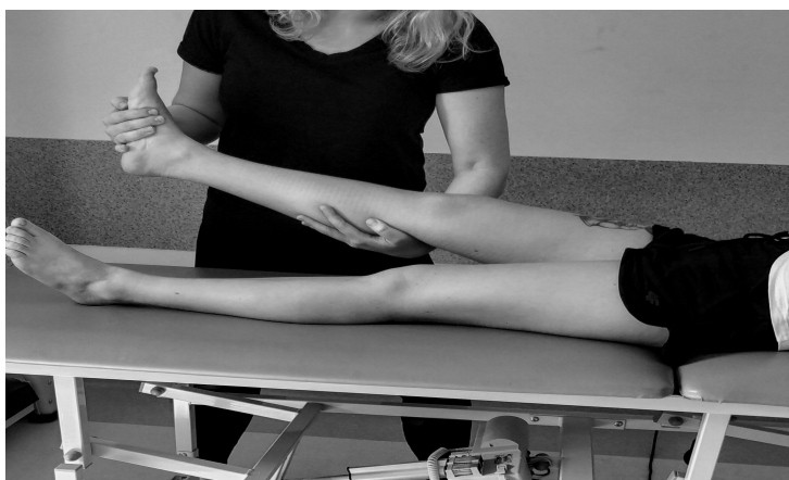
Dwg. 1. The SLR test.

Conventionally described by JJ Frost, the SLR test is performed in the lie back position by passive lifting of a leg with a knee streghtened out till the moment when the pain in the low back occurs and it radiates along the lower limbs, next the therapist repeats the movement with the leg bended in the knee and the hip (3). If the differentiating movement occurs simultaneously with the change of symptoms, the involvement of the neurodynamic movement is possible. It is essential to avoid various deviations while performing movements in the frontal and transverse planes because those movements increase the test sensitivity (further discussion on this topic will be presented in another part of this article). This manoeuvre is used when the pain ailments and other sypmtoms occur in the posterior and the lateral sides of the lower area of the body, however it can also be applied in the pain ailments of the thoracic spine (4).