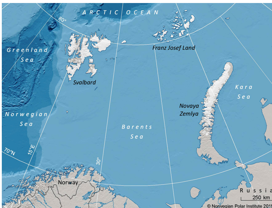
Fig. 1 The Barents Sea and surrounding land areas. The Barents Sea polar bear population is distributed from Svalbard in the west to Franz Josef Land in the east. The majority of the polar bears in the population is found in sea-ice covered areas between, and north of, these archipelagos.

aerial surveys, which were extrapolated to larger areas. No study covering the whole area in question had been undertaken prior to the survey conducted in 2004 (Aars et al. 2009). Most population estimates for polar bears have been derived using capture–recapture methods (e.g., DeMaster et al. 1980; Taylor et al. 2005). Obtaining sufficiently large sample sizes is time consuming and expensive (Wiig & Derocher 1999), but the method yields valuable data on individuals for a range of other population ecology studies. Recent statistical developments have made distance sampling one of the most widely used methods for estimating animal abundance in the last decade (Buckland et al. 2004) and it is today regarded as being more cost efficient than capture–recapture to achieve high levels of precision (Borchers et al. 2002), in particular for populations occurring at low densities over large areas.