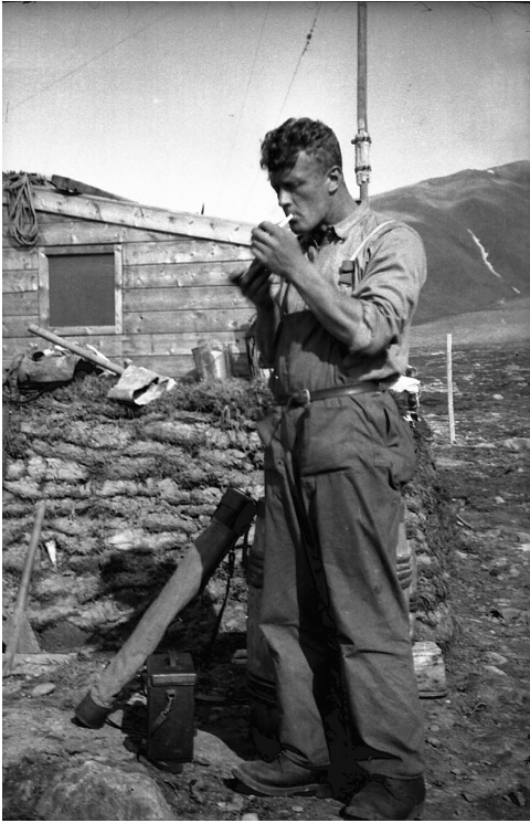
Helge Ingstad, appointed governor of Erik the Red's Land, in the Davyfjord area of East Greenland, 1933. After the Hague ruling, Ingstad left for Spitsbergen, where he served as regional governor for several years.