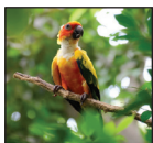
"Watching and listening to singing birds, remind me what a blessing it is to be alive" Fujifilm XE2s 250mm