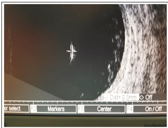
Fig. 2: Ringing bell sign on B – scan. Size of silicone oil bubble is 0.3mm.

history of ocular surgery apart from intravitreal Bevacizumab. We noted intravitreal silicone oil bubble suspended in superior half of post vitreous cavity but could not capture this finding on fundus camera due to very small and indistinct appearance of this bubble on photography. Her last injection was one month ago. She also remained symptom free.