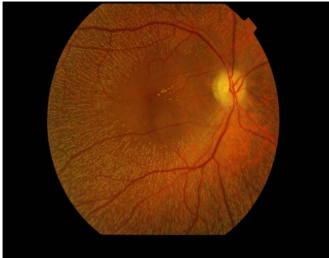
Fig. 1: Fundus photograph of right eye

All these findings were consistent with diagnosis of benign retinal flecks with neuroretinitis.