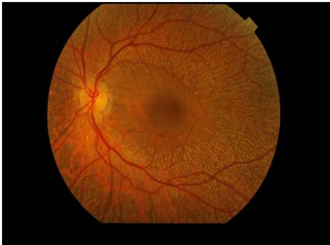
Fig. 2: Fundus photograph of left eye