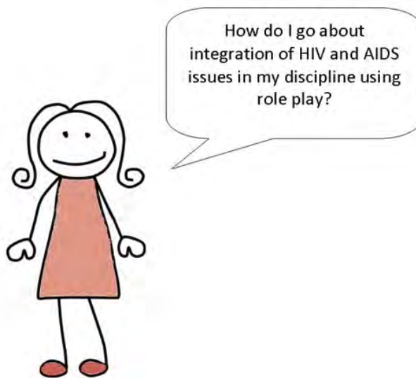
Figure 3: Screen shot from digital animation: Take a risk: It's as easy as ABC!

The suggestion to use more colours and improve on the background song draws attention to the need for us as BBs or Xers to be more familiar with the interests of Millennials when we are using digital animation as a teaching or research tool.