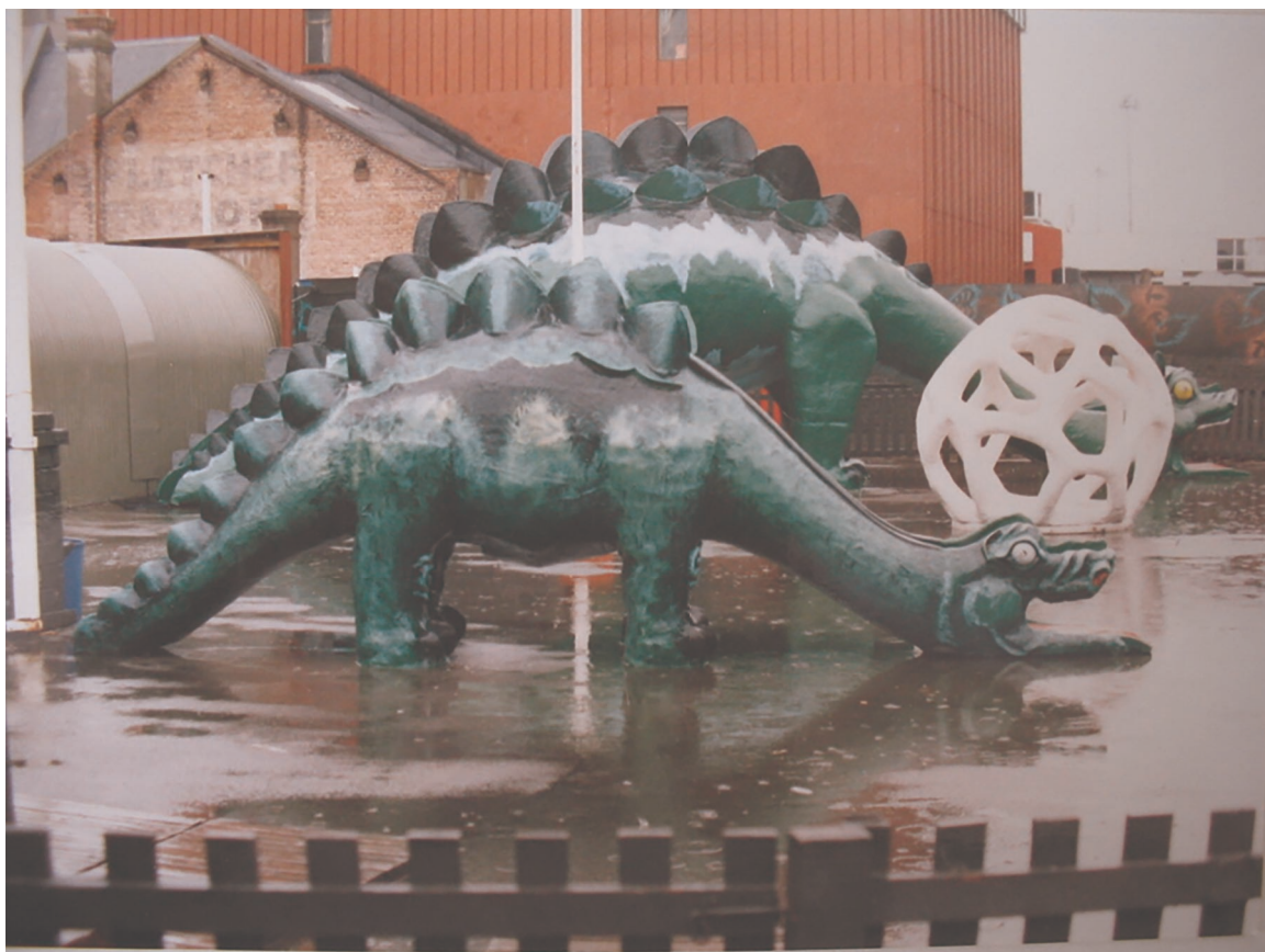
The roof in January 1980.