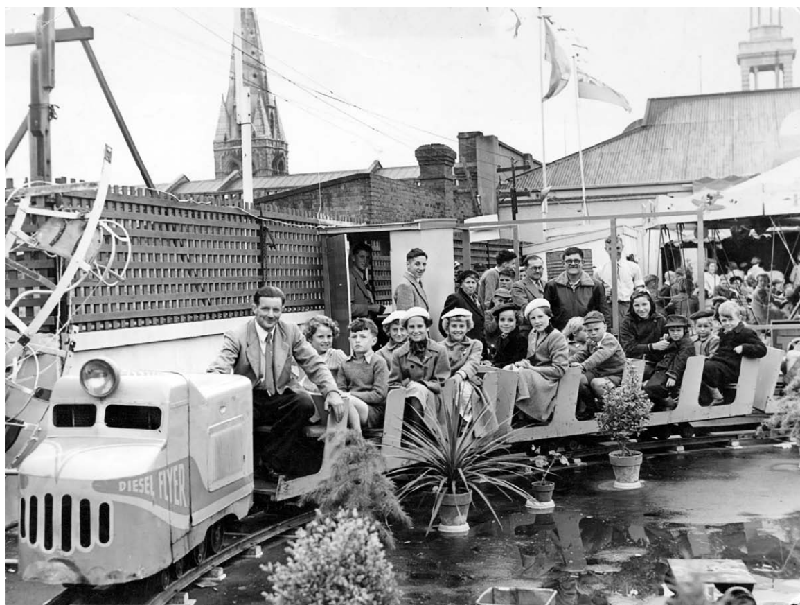
Miniature Railway, Hay's Ltd roof 1950s.