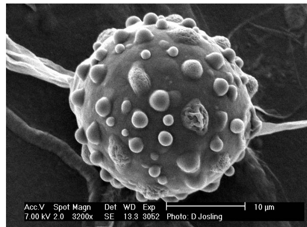
FIG. 2 SEM of a chlamydo-spore from a South African isolate of Duddingtonia flagrans