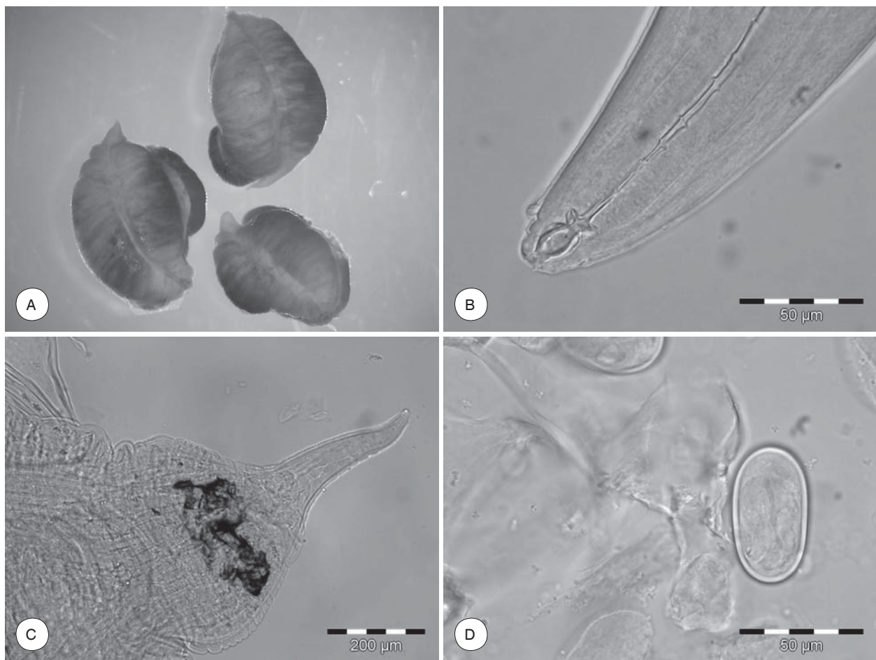
FIG. 3 Tetrameres numida n. sp. Female. A. Three whole specimens, approximately 4 mm in length. Note the globular shape. B. Anterior extremity. C. Posterior end. Note the digested blood showing as dark smudge. D. Egg containing fully developed larva

filled uterus coils surrounding a large sacular intestine. Body length 4.2–5.3 mm, maximum width 2.6–3.5 mm. The following measurements were derived from a single specimen: The deirids are at 179 and 190 and the nerve ring at 215 from the apex, respectively. The excretory pore could not be located. Depth of buccal capsule 23, inner diameter 7. Muscular part of oesophagus 333, the distal part of the glandular oesophagus obscured by the uterus. Eggs are elongate with near parallel sides, polar filaments were not seen (Fig. 3D). Eggs containing fully developed larvae are 56–59 long and 31–34 wide. Anus and vulva appeared to be confined in body folds. Emerging from the last body fold is a tail approximately 336 long with a simple tip.