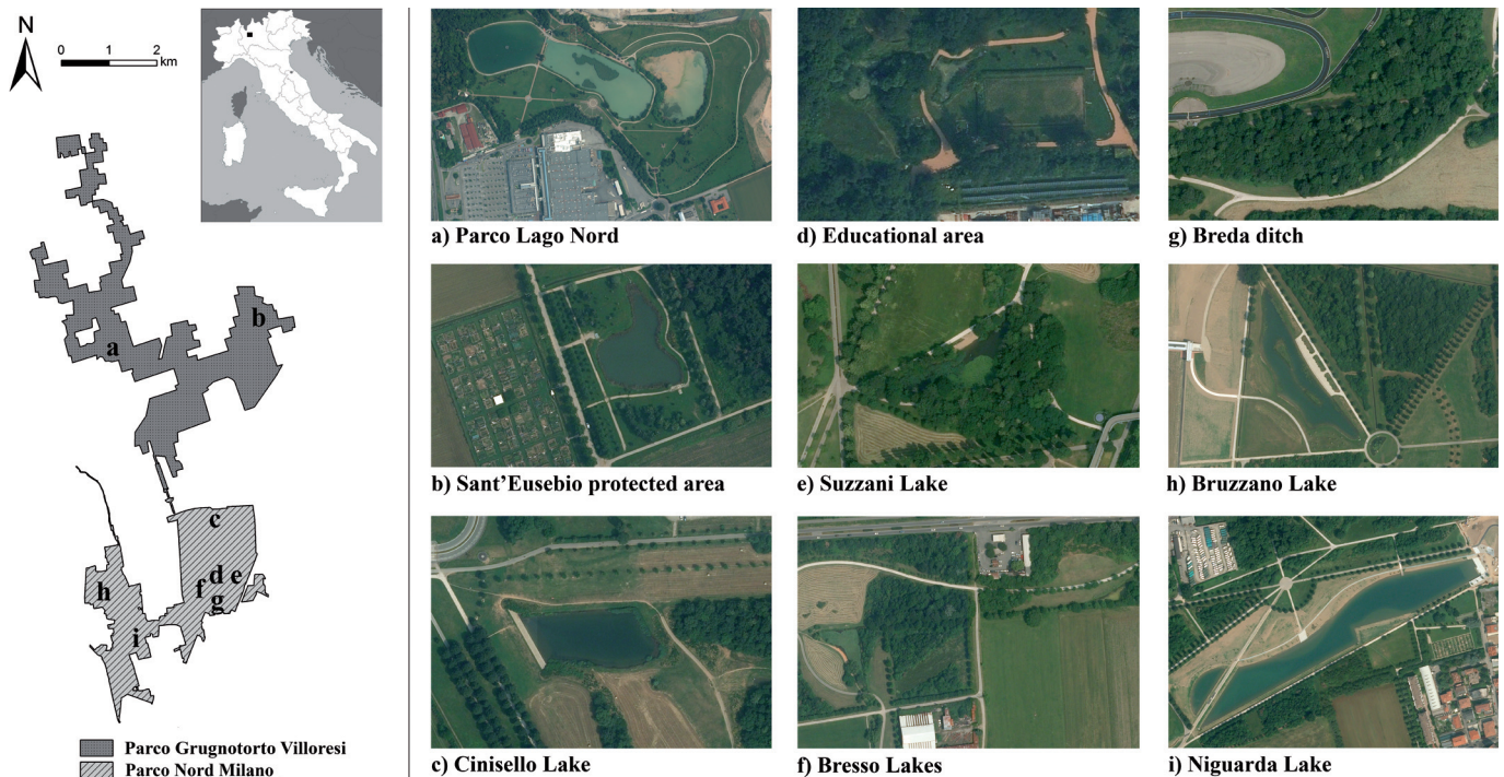
Fig. 1 - Study area (Lombardy region, Northern Italy). Letters indicate each studied wetland (modified from www.d-maps.com and GeoPortale Regione Lombardia). / Area di studio (Lombardia, Italia Settentrionale). Ogni lettera identifica un'area umida indagata (modificato da http://www.d-maps.com/ e GeoPortale Regione Lombardia).

A list of the non-native turtle species found in the study area is provided in Table 2, and their distribution is shown in Fig. 2. The presence of four cooters Pseudemys sp. (Gray 1856) and 10 false map turtles Graptemys pseu-