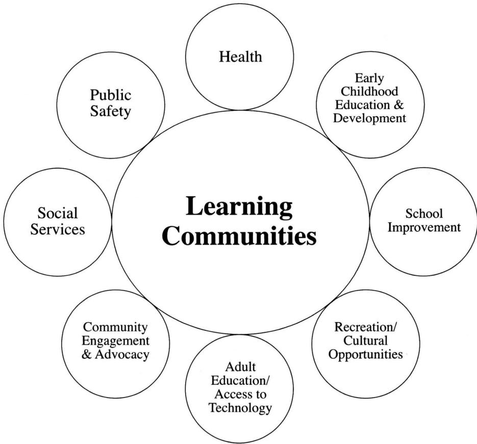
Figure 4. Newark Fairmount Promise Neighborhood Learning Communities Structure