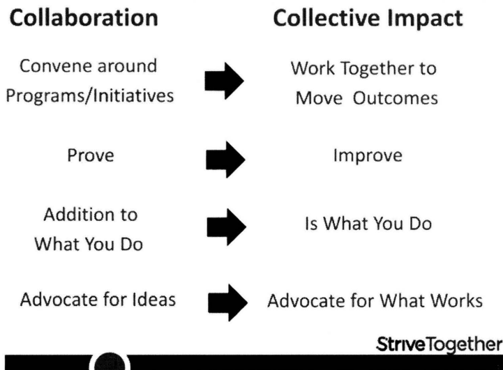
Figure 1. Slide 4 from “Strive Overview” presentation (StriveTogether 2013)

During the K-12 + Higher Education Partnerships Action Summit held at the 2013 Coalition of Urban and Metropolitan Universities conference, StriveTogether, a cradle to career student success networking organization, presented collective impact as an approach purportedly signaling a shift from collaboration. While the underlying intent of StriveTogether’s presentation might have been to convey that collective impact expands or builds upon collaboration, one particular slide in StriveTogether’s presentation suggests that collaboration as a process and approach is outmoded (see Figure 1).