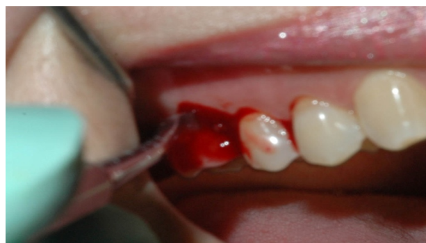
Figure 1. The "assisted drainage" therapy.

Treatment was initiated with prophylactic procedure using rotating brush, pumice and contra-angled-low speed-handpiece. The pseudopockets and interdental spaces were irrigated with hexetidine 0.1%; after one minute the assisted drainage therapy (ADT) was done. The ADT was a procedure developed for removing subgingival plaque within the pseudopockets of the chronic gingivitis area which concomitantly drained the inflammatory mediators using a sickle shaped sealer. The sealer was moved slowly forward and backward with gentle pressure until bleeding comes (Figure 1). The patient was told to raise his left hand if pain felt. Interestingly, the ADT which performed in chronic gingivitis does not elicit pain. In this case, coincident with other chronic gingivitis cases, the dark red blood oozed from the interdental spaces and pseudopockets, especially in the upper left and right posterior teeth.