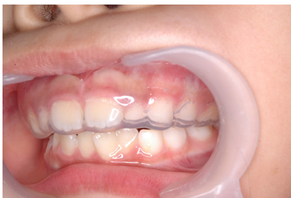
Figure 4. Soft night guard for children with short teeth (extended buccal flange).

Ideally, it was suggested that the treatment of SB using night guard or occlusal splint should follow rules regarding to the type of SB i.e. severe grinder or mild grinder. 13 In addition, according to Okeson 20 the ideal occlusal splint or night guard for SB should be fabricated from hard clear acrylic. However, relevant to Widmalm, 21 soft night guards were preferred by some patients because their cushioning effect. Therefore, considering that children are: a) possibly careless i.e. unintentionally break the hard night guard; b) have poorer motivation and compliance; c) not easily adapted to pressure to the teeth which more pronounced in hard night guard; and d) still have erupting permanent teeth and short primary teeth that which could not easily adapted by hard night guard and lack of retentive area. Thus, soft night guard is preferred to be used by children. Moreover, for increasing retention in short teeth, soft night guard flange could be extended to the vestibule, which mimicking full denture with minimal discomfort (Figure 4).