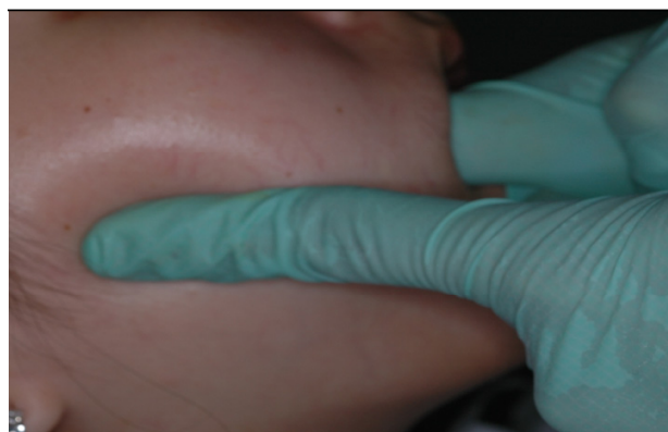
Figure 2b. Masseter muscle massage.

the outer and inner "cheek" masticatory muscle (laymen's term of the masseter muscles) regularly (2–3 times/day) for five minutes for helping reduce the muscle spasm (Figure 2b).