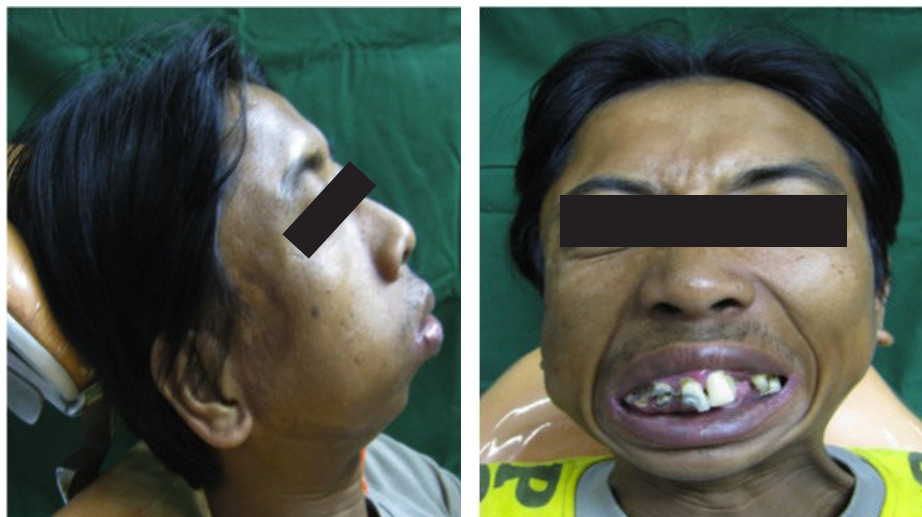
Figure 1. The profile of the patient showing "bird face" appearance indicating a severe mandibular retrognathism (left) and severe trismus (right).

Clinical examination showed facial asymmetry with large area of scar tissue on his right zygomatic and preauricular region, mandibular retrognathism, and severe trismus (Figure 1). Intra oral examination was difficult to perform due to the trismus. Panoramic x-ray showed ankylosis of the right temporomandibular joint whereas the left joint seemed somewhat normal with the presence of joint space (Figure 2). CT scan of the head revealed loss of the normal structure of the right temporomandibular joint showing large ossification area over the region (Figure 3). The diagnosis made was bony ankylosis of the right temporomandibular joint.