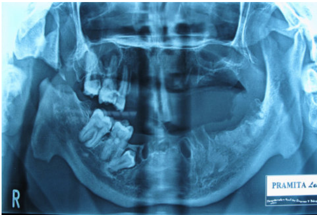
Figure 4. One week post-operative panoramic x-ray showing the gap created in the right subcondylar neck.