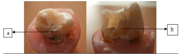
Figure 2. Fracture patterns of repairable (a) location of fractures in the crown and (b) location of fractures in the crown and post.

The occurred fracture distribution can be analyzed after the endurance test of the fracture by analyzing the location of the fractures in the whole sample. The location of the fracture pattern was divided into two categories; repairable when fractures occur in the crown, post and crown, and cervical (Figure 2). Irreparable for the fracture patterns in the middle root teeth, horizontal and vertical cracks until the root of the teeth (Figure 3). 11