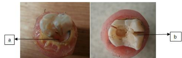
Figure 3. Fracture patterns of irreparable (a) location of fractures in the middle of the root and (b) location of vertical cracks along the root.

The result of Kruskal-Wallis test on the fracture pattern observation, data obtained value p = 0.392 ( p > 0.05 ) indicating that there was no difference in the fractures distribution among the four groups or there was no difference of fracture pattern between irreparable and repairable.