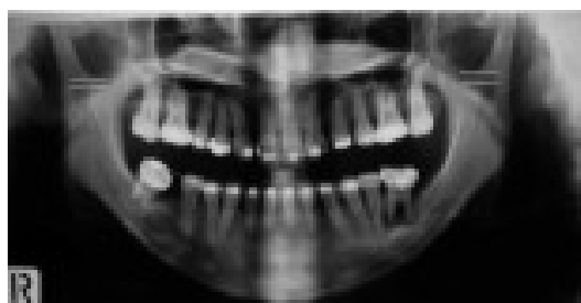
Figure 2a. Panoramic radiograph show narrow spaces between the sigmoid notch and mandible foramen in both sites.

A routine surgical procedure was planned and a panoramic radiography was used guiding the surgical judgment. The mandible evaluation of the medial ascending ramus showed unavailable spaces between both sigmoid notches and the mandible foramina (Figure 2a). The spaces available in the area between foramina and sigmoid notches are necessary, as the bone incision for performing a bilateral-SSRO (BSSRO) are took place in these areas.