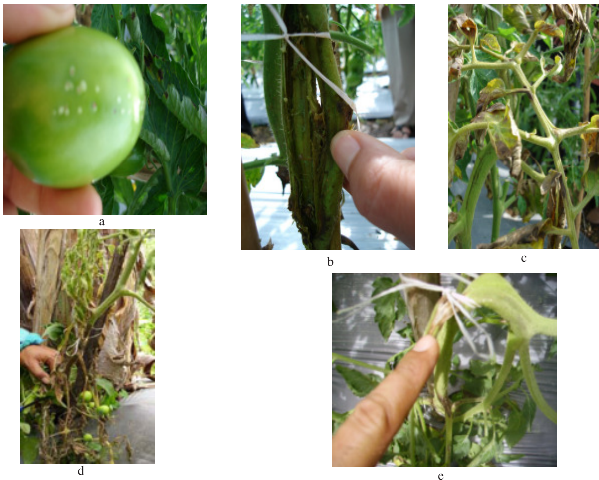
Fig 1 Examples of tomato showing typical symptoms of suspected Clavibacter michiganensis subsp. michiganensis infection observed in the field. a, tomato fruit showing bird's eye spot symptoms (arrow) from Danau Kembar, Solok, West Sumatera and tomato plants showing; b, split stem secretion and showing pith discoloration (arrow) from Lembah Gumanti, Solok, West Sumatera; c, wilting leaves and necrosis at the leaf perimeters from Matus, Kediri, East Java; d, blackened stem, wilting leaves and necrosis at the leaf perimeters from Wanayasa, Banjarnegara, Central Java; and e, stem necrosis (tissue discoloration) from Cipanas, Cianjur, West Java.