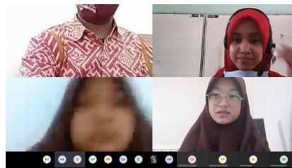
Figure 1. The process of managing online learning

Teacher and student activity data were obtained through observations during learning by joining the Microsoft Teams application and carried out by one observer using the teacher activity observation sheet instrument managing learning during two meetings. Student activities are observed by the researcher himself using student activity observation sheets. Observations were made on a group consisting of four students with high, medium and low academic abilities in each meeting. The following are some pictures in the process of managing online learning in the trial class, which can be seen in Figure 1 and Figure 2.