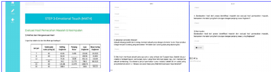
Figure 6. Display Design of the Ain Dubai Theme Emotional Touch Stage (Mathematics)

to find out how students understand the concepts that have been used in the first and second stages then students are directed to determine what conclusions are obtained from the problems that have been solved.