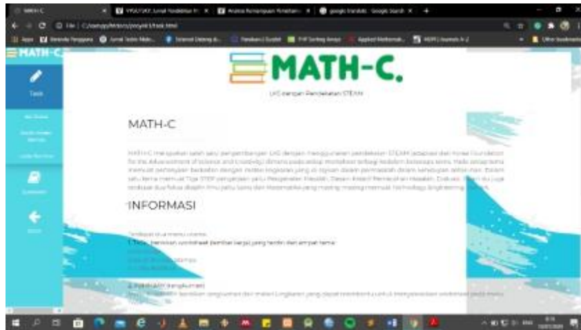
Figure 2. Display Design of Main Themes of STEAM-Based Digital Worksheets to Develop Students' Problem Solving Ability

there will be two sub-sciences that are different but have a relationship with the theme raised, these sub-sciences are the sub-sciences and mathematics.