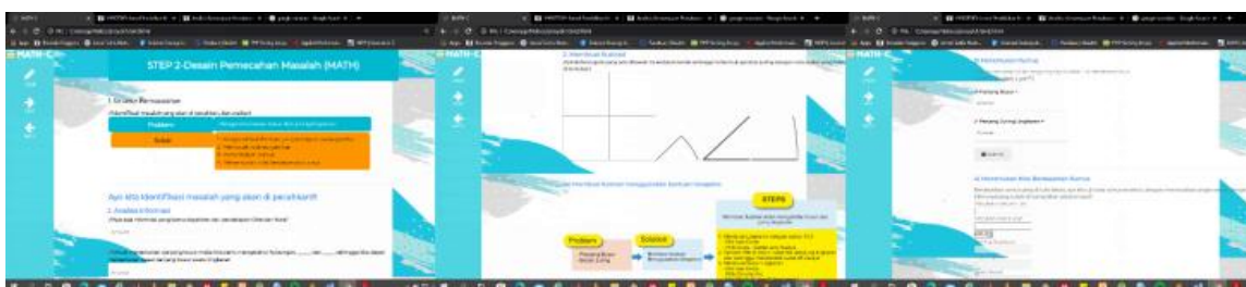
Figure 5. Problem Solving Design Process Presentation Design (Mathematics)

Presentation of the problem-solving process in mathematical material is usually seen in working on a problem. There is no clear division regarding the structured problem-solving process (Sholekah et al., 2017). The second stage of presenting the problem according to the STEAM stage is the problem-solving design (Creative Design). This stage aims to meet the problem-solving indicators in the IDEAL problem-solving model, namely investigating problem-solving strategies and also implementing problem-solving strategies according to the results obtained in the first stage. In figure 5, the questions posed at this stage are in the form of short questions designed by applying the relationships of the concepts from the circle related to the derivation of the formula that can be used to solve problems according to the results of the first stage.