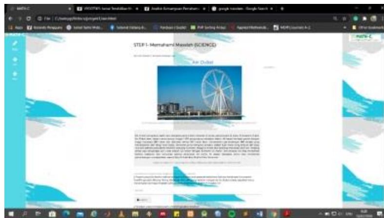
Figure 3. Examples of Presenting Problems in the Ain Dubai Theme in Science Sub Material.

In the sub-science that is presented in this LKS in the form of story questions with included pictures that are adjusted to the themes provided. An example is like the first theme in Figure 3. The topic that is the main theme of the Ain Dubai theme is about the giant Ferris wheel named Ain Dubai so that the questions presented are in the form of physics concepts found in Ain Dubai. This science problem is presented to help attract students' curiosity or interest in learning before solving math-related problems, as well as to provide new information to students for examples of applying math and science concepts in everyday life.