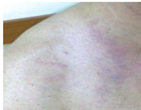
Figure 1. Clinical appearance of right upper extremity of the patient

On physical examination, the right arm was swollen with moderate enlargement compared to the left, and erythema and venous engorgement was noted. All peripheral pulses were easily palpable. The diagnosis of axillo-subclavian thrombosis was made, while Doppler ultrasound showed thrombosis in the right subclavian and axillary veins. Laboratory tests showed elevated D-dimer.