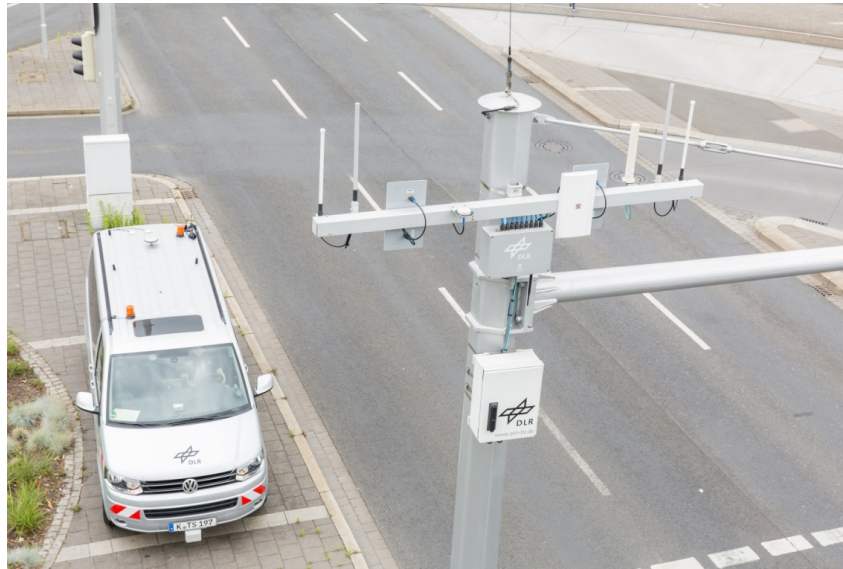
Figure 4: Reference Vehicle T5.

public roads. As a moving lab in AIM it is also be used for project specific application in the field of V2X.