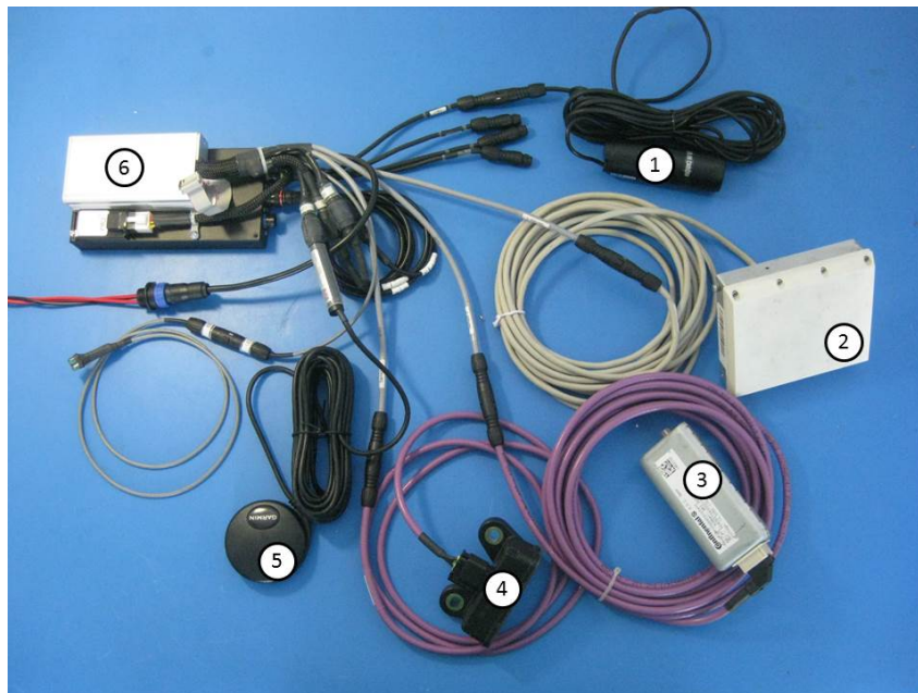
Figure 3: Naturalistic Driving Platform.