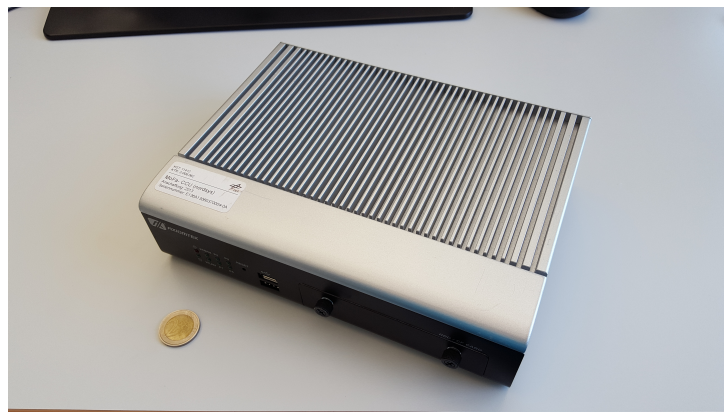
Figure 1: V2X communication unit.