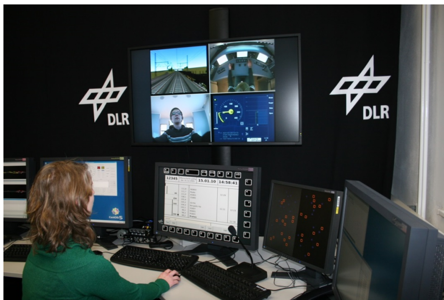
Figure 4: Investigator's workplace associated to the RailSET.

physiological parameters can be measured while driving. Figure 4 shows the workplace of the investigator outside of the RailSET with video transmission of the train driver, the track the driver sees in front of him or her, the control panel and the Driver Machine Interface DMI (e.g., for the European Train Control System ETCS). From this workplace, the investigator can also give instructions to the train driver.