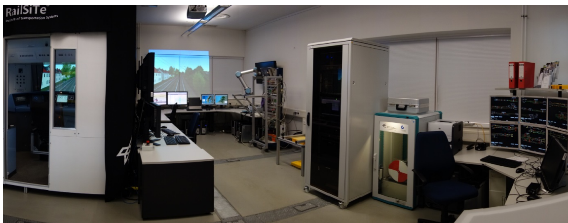
Figure 1: RailSiTe ® simulation and testing laboratory.

Abstract: RailSiTe ® (Rail Simulation and Testing) is DLR's rail simulation and testing laboratory (see Figure 1). It is the implementation of a fully modular concept for the simulation of on-board and trackside control and safety technology. The RailSiTe ® laboratory additionally comprises the RailSET (Railway Simulation Environment for Train Drivers and Operators) human-factors laboratory, a realistic environment containing a realistic train mockup including 3D simulation.