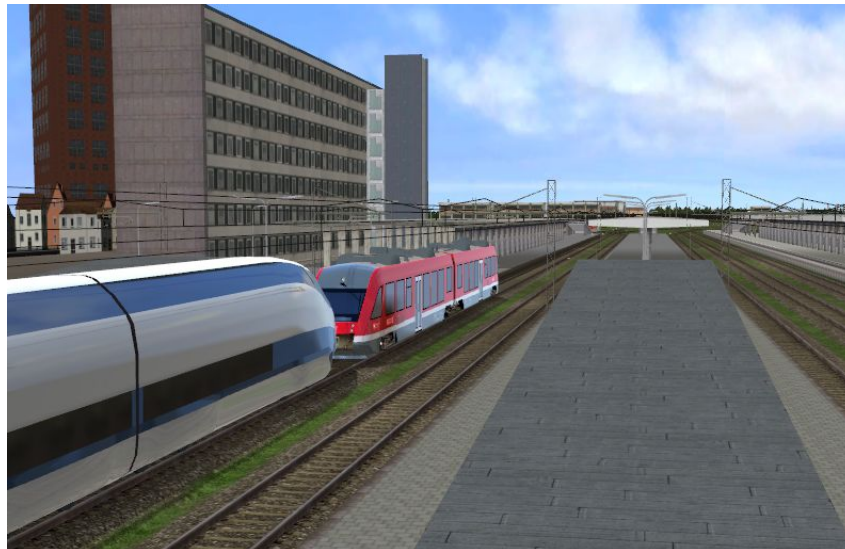
Figure 3: Example of the visualized track simulation.

physiological parameters can be measured while driving. Figure 4 shows the workplace of the investigator outside of the RailSET with video transmission of the train driver, the track the driver sees in front of him or her, the control panel and the Driver Machine Interface DMI (e.g., for the European Train Control System ETCS). From this workplace, the investigator can also give instructions to the train driver.