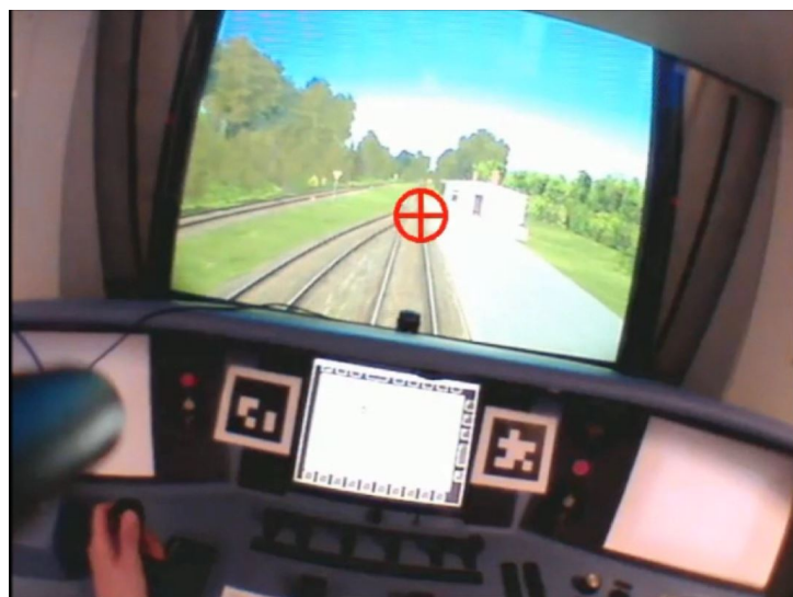
Figure 6: Eye movements of the train driver. The red cursor marks the attention focus.

With the RailSET environment, new user interface concepts can be tested regarding usability in a realistic environment, either as software simulations or as hardware prototypes (Naumann et al., 2013). For example, attention distribution between DMI and track can be measured via eye tracking in order to evaluate new DMI concepts (Figure 6; Kohl et al. (2016)).