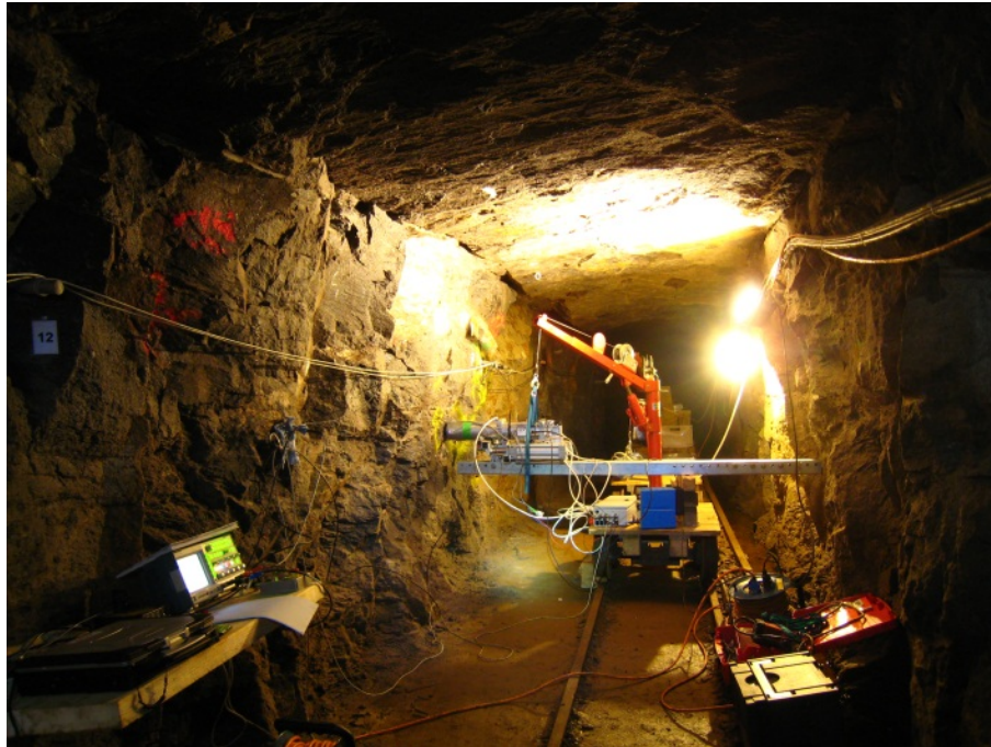
Figure 2: Pneumatic impulse hammer source pre-stressed against the Richtstrecke gallery wall (see Fig. 1).

horizontal and the vertical boreholes of the GFZ Underground Laboratory (Jaksch et al., 2010). The measurement results demonstrate the possibility of focusing seismic wave energy in the desired directions.