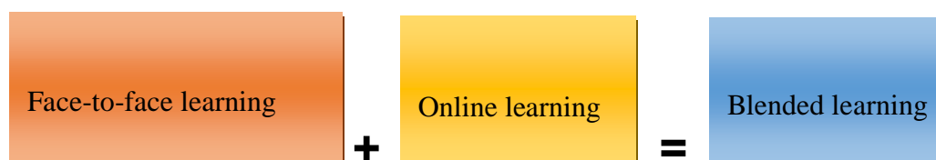
Figure 1. A Conceptual Model of Blended Learning (Adapted from Graham, 2006)

Face-to-face meetings are considered conventional learning since learning activities take place directly in the classroom. In contrast, online learning takes place outside the school with the use of advancements in digital technology. The combination of these two learning concepts can be shown in Figure 1 below.