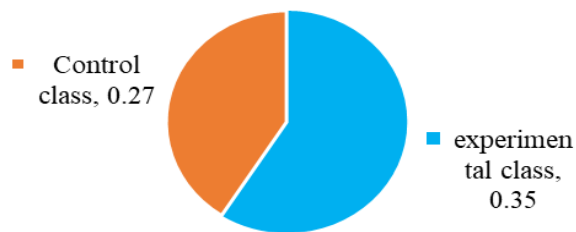
Figure 2. Average Result of Gain Score

It can be shown in Table 3 that the findings of the experiment were better than those of the control group. The comparison between the two groups can be represented in Diagram 1 below.