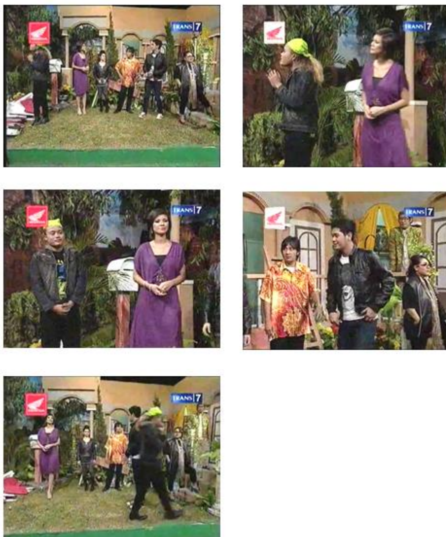
Gambar 3: Logo Iklan Honda