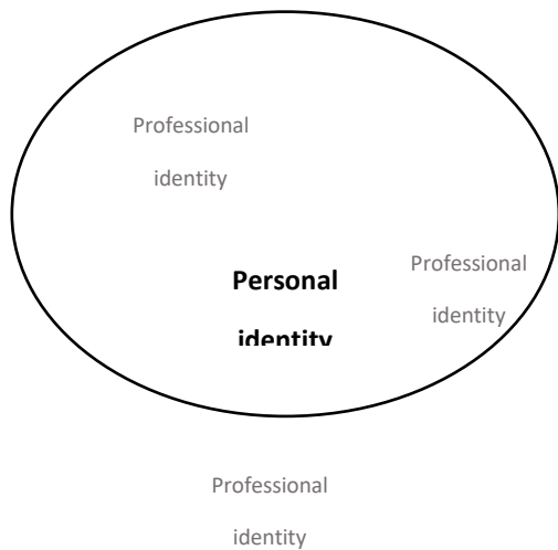
Figure 2.1 Personal identity formulates professional identity

Indonesian teachers perceived that teachers' professional identity cannot be removed from personal Identity. Figure 2.2 explains the position of personal identity as a personal domain in a social domain. As a consequence, in a teacher's personal domain, professional identity also contributes to the actions, behaviours, and attitudes of the teacher in a social setting. It is stated as follows: