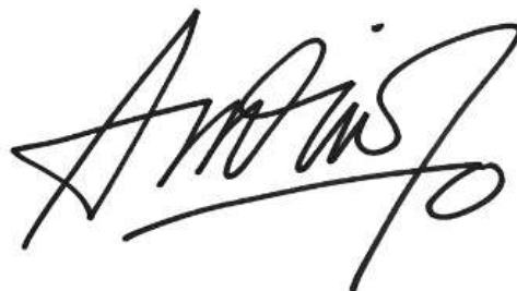
Fig. 4. The result of width normalization process

Fig. 5 is an example of a grid feature process result. In this discussion will look for the appropriate composition of the grid distribution. In general, the more the grid distribution, the greater the accuracy level, but requires memory and computation time that is greater. Therefore, it is needed to be done the grid testing of 3x3, 3x4 or 5x5. The experimental results are presented in Table 1.