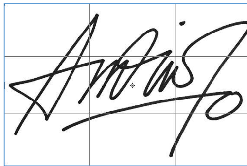
Fig. 5. Example of signature grid feature