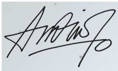
Fig. 1. Scanning process

Noise is dots on the image which are not a part of the image, but also in the image for a reason [10]. Noise is something undesirable, regarded as the cause of the lack of detail of the signature object. Therefore, noise reduction used to eliminate objects that are outside the signature area thus making the object or image detail becomes better. The result of the noise reduction process shown in Fig. 3. In image processing, normalization is a process that converts the pixel intensity range. Length and width dimensions of an object image are different. In this stage, the length and width of an object have to be recognized. In this stage, width normalization process was done by cutting the space between the edges of the image with the image object using Adobe Photoshop software. The outcome of this process is shown in Fig 4.