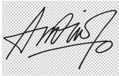
Fig. 3. The result of noise reduction process

Image processing is done to improve the image quality to be easily interpreted by a human or a computer for certain purposes, which in this study image processing used for the signature recognition. Hence, SOM Kohonen method implemented for image processing in the form of a signature. SOM Kohonen method requires some featured values that are extracted from the image.