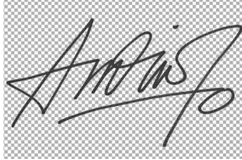
Fig. 2. Background elimination