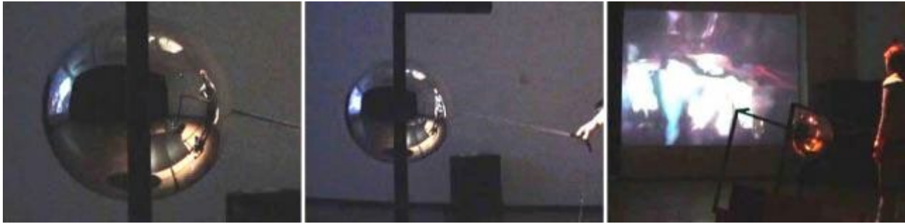
Figure 3 | Set up of the installation I/VOID/O by Sandro Canavezzi de Abreu.

The mergence of the gaps found in both between the systems in translation and between object and observer is materially and metaphorically expressed in the installation I/VOID/O (2002-2010), by Sandro Canavezzi de Abreu, in collaboration with Daniel Barreiro, who designed the soundscapes. This installation is the last and interactive version of an aesthetic investigation that started with the following imaginary situation: What could one see if located inside a completely mirrored sphere? The installation and the whole creative process is depicted and analysed by the artist in his doctoral thesis (Canavezzi, 2011), who built the mirrored sphere embedding inside four cameras: one is movable while fixed at the tip of a stick to be manipulated by participants; other two are linked to produce stereoscopic images, and a forth that is fixed in attempt to capture an objective observation of what happens inside the infinitely reflexive black-box (Barreiro et al., 2009). A version of the installation's set up can be seen at Figure 3.