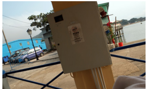
FIGURE 3 | Écho 3 , Jerry Chan, 18 th Mar. 2013 Port de Coloane