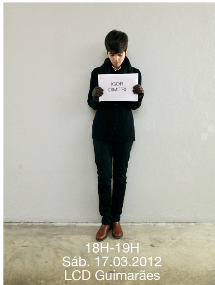
FIGURE 1 | Poster for performance 'Join'.

'I', an installation by Pedro Ângelo, Rebecca Moradalizadeh and Sónia Ralha remind us that the physical space we inhabit is imperceptibly changed and fulfilled by thousands of invisible waves coming from all the technologies and media that surround us. By entering the installation space, the visitor becomes an involuntary participant in the soundscape composition, which emerges from the interferences provoked by the visitor's mobile phones. When approaching one of the seven copper-cables vertically placed between the ceiling and the ground, the electromagnetic field of the