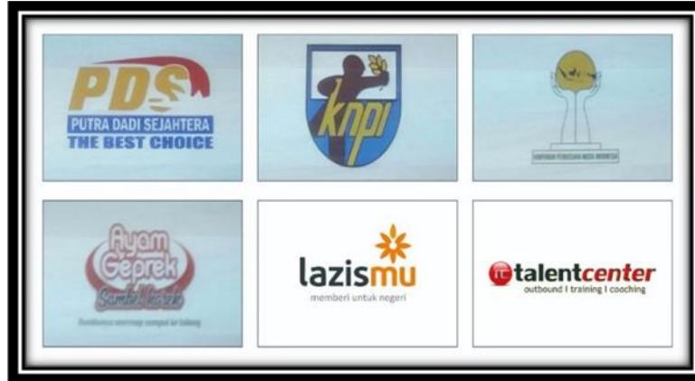
Figure 2 Logo of the Main Sponsor of the Sragen Business School