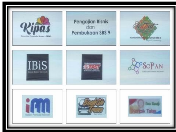
Figure 3 Alumni Community Supporting Sponsor Logo Sragen Business School

Source: Interview with managing director #1