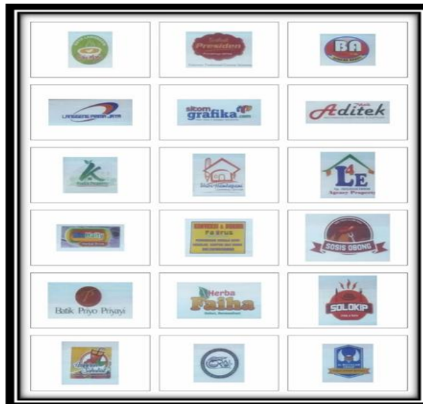
Figure 4 Logo of Sponsor for Alumni of Sragen Business School