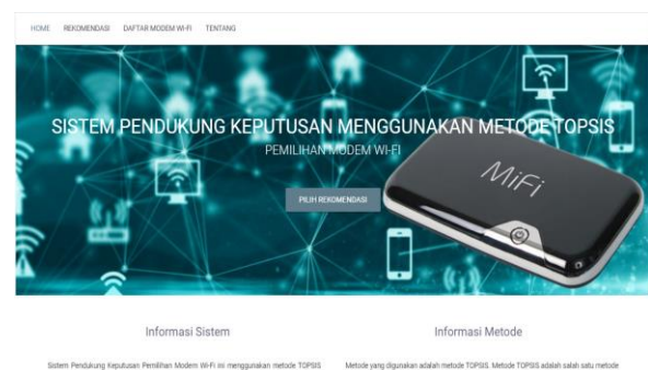
Figure 2. System Main Menu Interface

After the TOPSIS analysis has been carried out, the TOPSIS algorithm is applied in a decision support system to choose a Wi-Fi Modem with the PHP programming language Notepad++ and the database using MySQL. The interface display on the decision support system for selecting a Wi-Fi modem is presented in Figure 2.