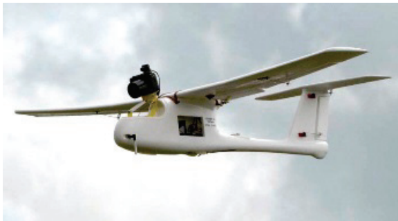
Fig. 1. A fixed-wing UAV.

UAVs also vary widely in size, shape and capability. They are generally categorized in two different categories: fixed-wing and rotary-blade. Rotary-blade UAVs are able to take off and land vertically; they are able to hover and to change direction and orientation when maneuvering in a small space. In contrast, fixed-wing UAVs can stay aloft longer, but may require short runways for takeoff and landing. As a result, most construction applications prefer using rotary-blade types which do not need runways (Babel and Brown, 2015). Rotary-blade UAVs may use single or multiple rotors, typically with an even number. Multi-rotor UAVs normally offer better maneuverability and robustness. Fig. 1 shows a fixed-wing UAV; Fig. 2 is a Rotary-blade UAV.