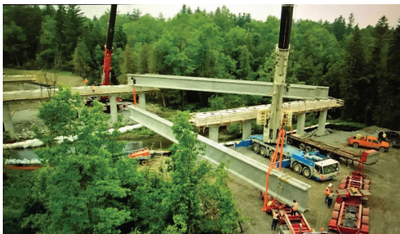
Fig. 4. Video-taking by drone assists girder installation during construction.

A surveys conducted in 2015 on the use of UAVs revealed the perspectives from the industry (Navigant, 2015). 50% of the respondents are contractors, construction managers and design builders; 14% are architects and engineers. The rest of the respondents represents the rest of broad spectrum of industry.