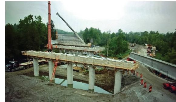
Fig. 5. Drone helps conduct site inspection of the arterial road construction.

In addition to inspection, safety monitoring, surveying and transportation, more than a dozen other uses were suggested, including security monitoring, defense against claims, and use in education to observe construction methods via virtual field trips.