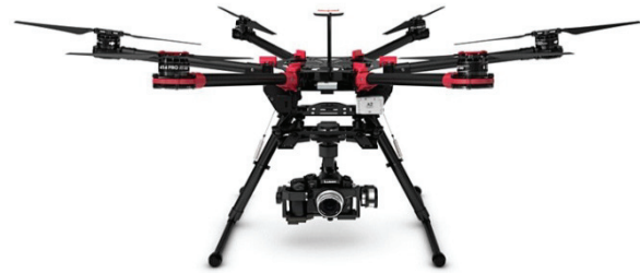
Fig. 2. A Rotary-blade UAV.

As UAVs can be easily equipped with camera or light detection and ranging (LiDAR) instruments they have great potential on construction jobsites. The use of high-density (HD) cameras for video (real time and recorded) and still images is common. UAVs can be controlled through joysticks, PC and laptop software, iPad and iPhone apps and are connected by Wi-Fi (Schriener and Doherty 2015). Many of today's UAVs use Global Navigation Satellite Systems (GNSS) for positioning, in combination with inertial measurement unit (IMU) that consists of accelerometers and gyroscopes. These sensors are integrated in a navigation computer, which allows them to follow designated routes or orientation autonomously.