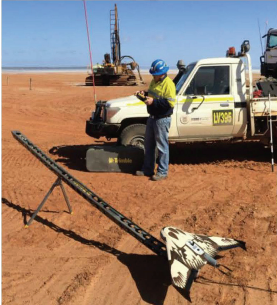
Fig. 7. Fixed-wing UAV has been recently used in St. Ives Gold Mine survey in Western Australia.

Drones have proven the respondents to be a useful tool on construction sites. 100% of those surveyed that have actually used a drone on a project reported it to be a success and are very satisfied with both the experience of using a drone and the quality of the results obtained.